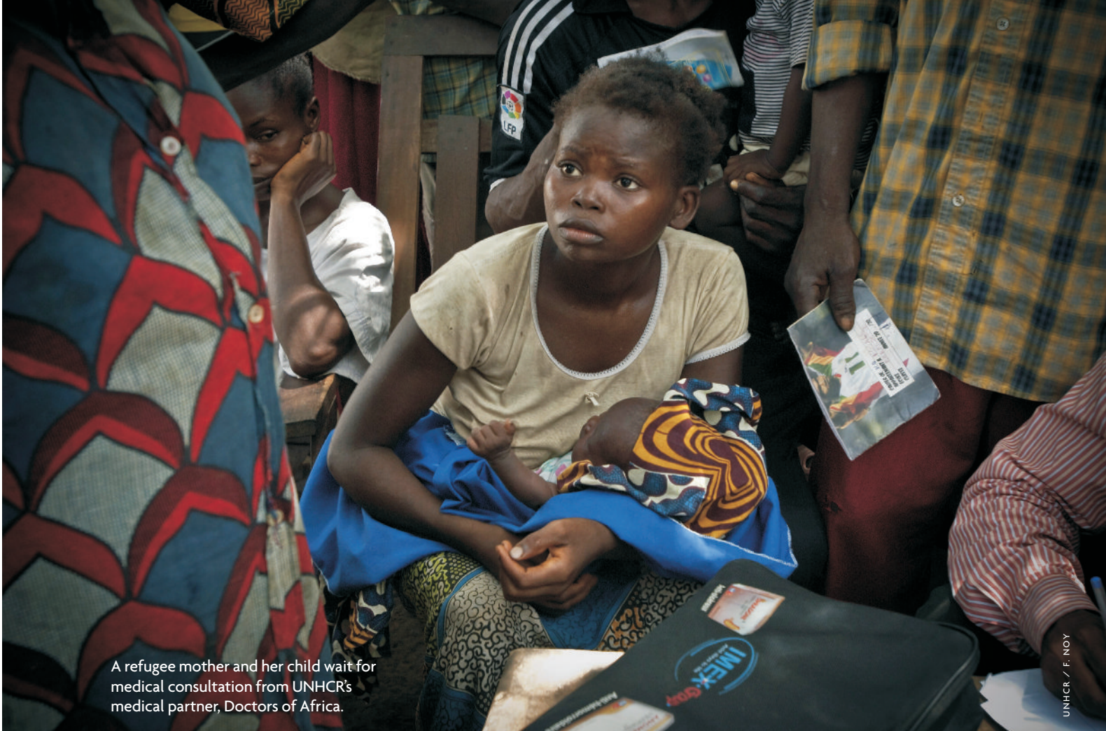
A refugee mother and her child wait for medical consultation from UNHCR's medical partner, Doctors of Africa.