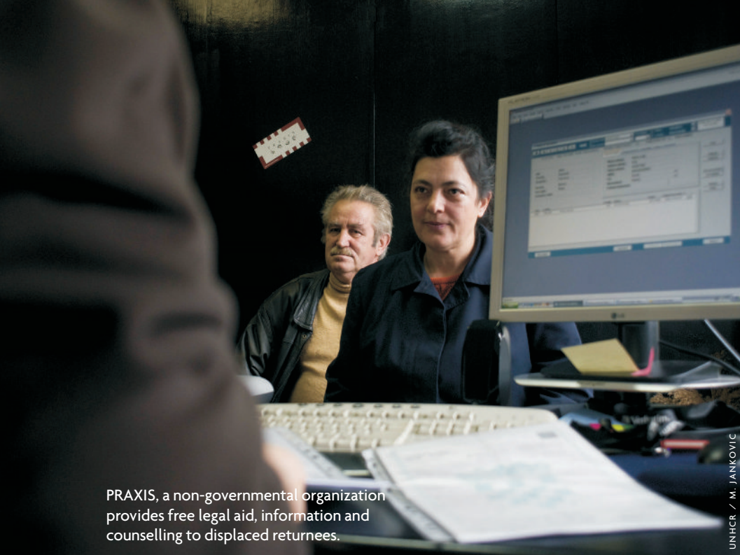
PRAXIS, a non-governmental organization provides free legal aid, information and counselling to displaced returnees.