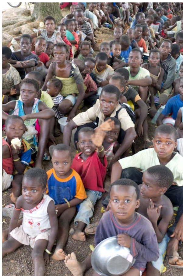
Internally displaced children at the Mission Catholique in Duékoué.