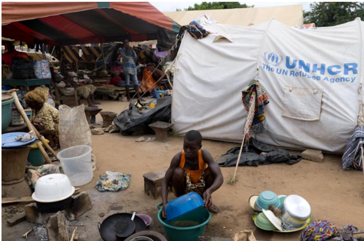
Mission Catholique site in Duékoué (Western Côte d'Ivoire).