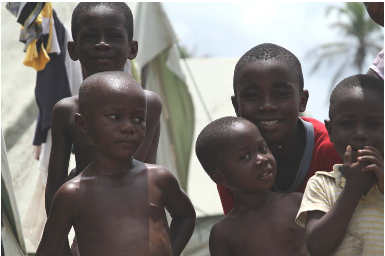
Refugee children, Ampain Camp, Ghana