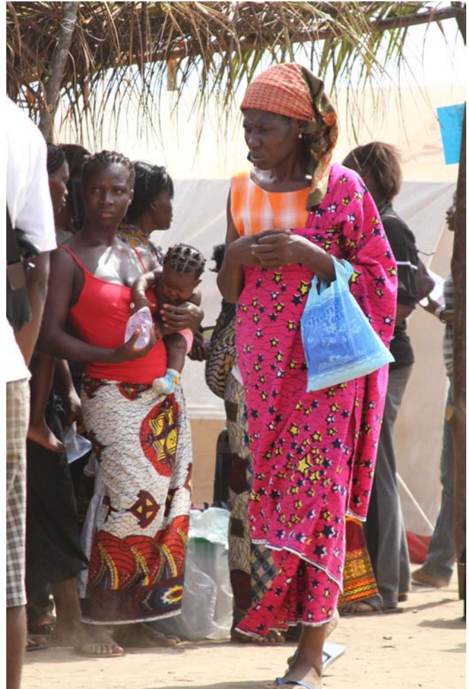
Refugee women, Ampain Camp, Ghana.

(*) In addition, Luxembourg donated USD 87,015 towards UNHCR's initial response in Côte d'Ivoire in December 2010.