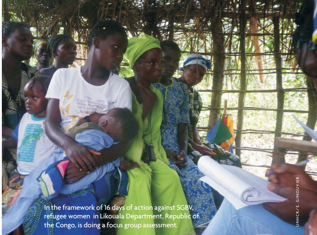
In the framework of 16 days of action against SGBV, refugee women in Likouala Department, Republic of the Congo, is doing a focus group assessment.

With the start of the voluntary repatriation programme for DRC refugees living in the Congo, UNHCR staff have accompanied cross-border visits by authorities and refugees. The intention of refugees to repatriate will be confirmed after the go-and-see visits, following which return movements should begin during the last months of 2011. These will continue throughout 2012 and 2013 if security in the DRC permits. Material assistance will be provided in 2012, but will be gradually reduced in favour of an extensive local integration programme for those refugees unwilling to return home.