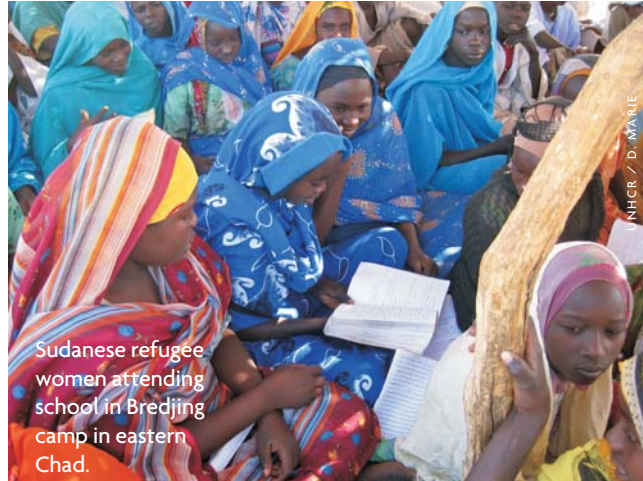
Sudanese refugee women attending school in Bredjing camp in eastern Chad.

The search for durable solutions for refugees and IDPs remains one of the main priorities for UNHCR in Chad. However, since prospects for the voluntary repatriation of Sudanese and CAR refugees are bleak for the time being, and the number of resettled refugees remains low, the provision of life-saving food, water, health services and sanitation continues to be essential, especially in eastern Chad. In southern Chad, UNHCR is focusing on improving self-reliance and livelihoods. The provision of education, meanwhile, is proving to be of