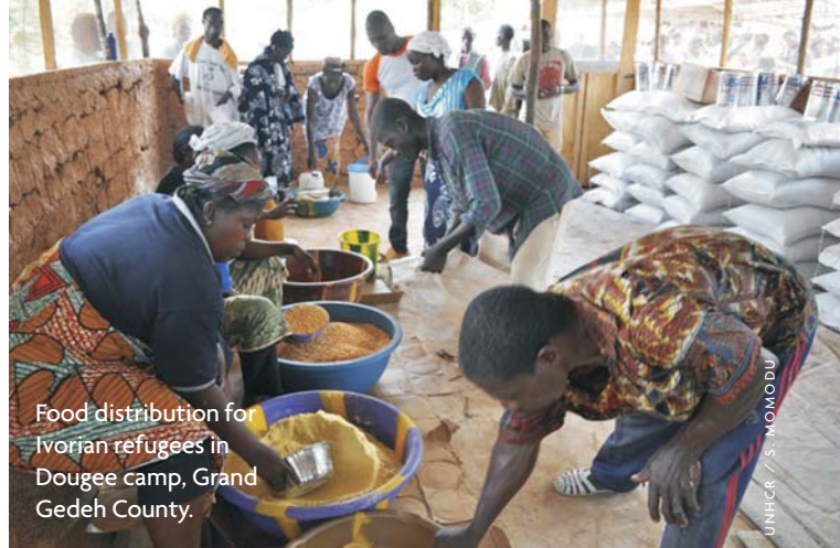
Food distribution for Ivorian refugees in Dougee camp, Grand Gedeh County.

UNHCR will continue to play an active role within the UN Country Team and the humanitarian community, fulfilling its mandate in leading the refugee response and ensuring wider awareness of the plight of refugees. UNHCR will also support targeted inter-agency and civil processes, including