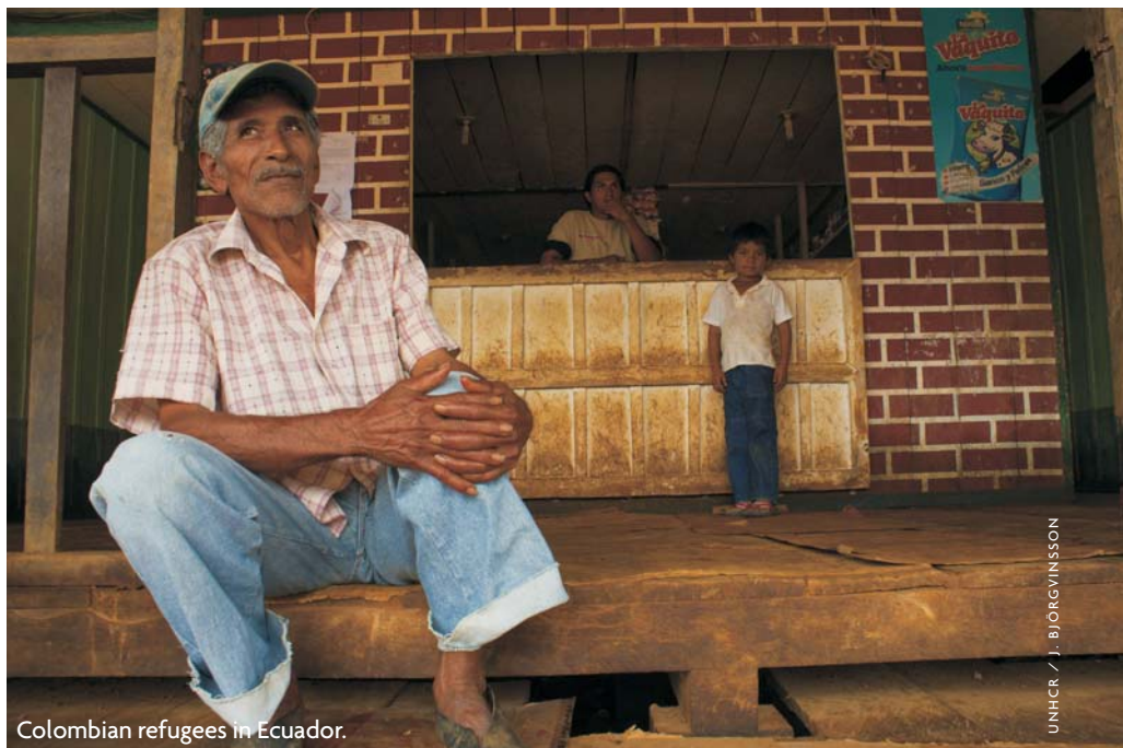
Colombian refugees in Ecuador.