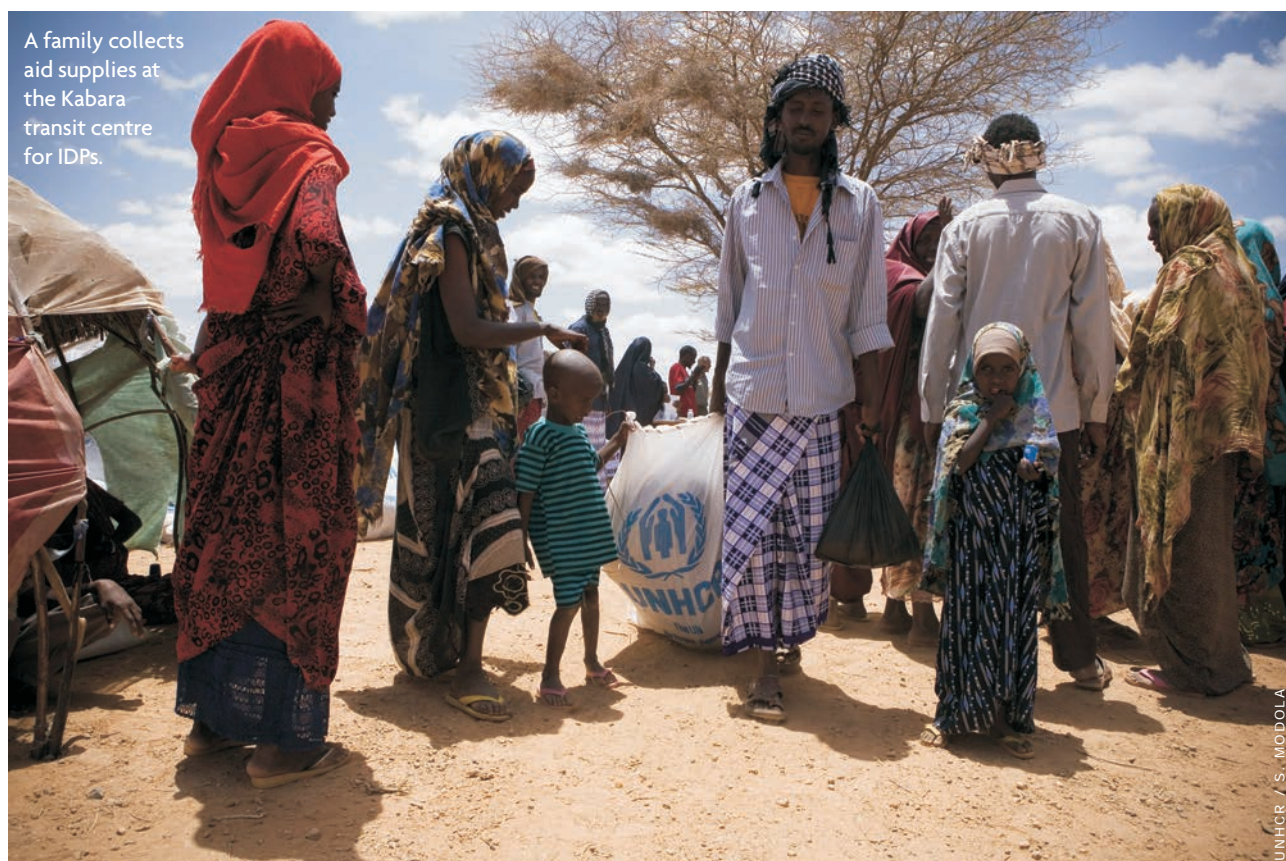
A family collects aid supplies at the Kabara transit centre for IDPs.