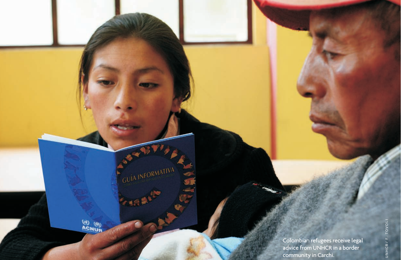
Colombian refugees receive legal advice from UNHCR in a border community in Carchi.