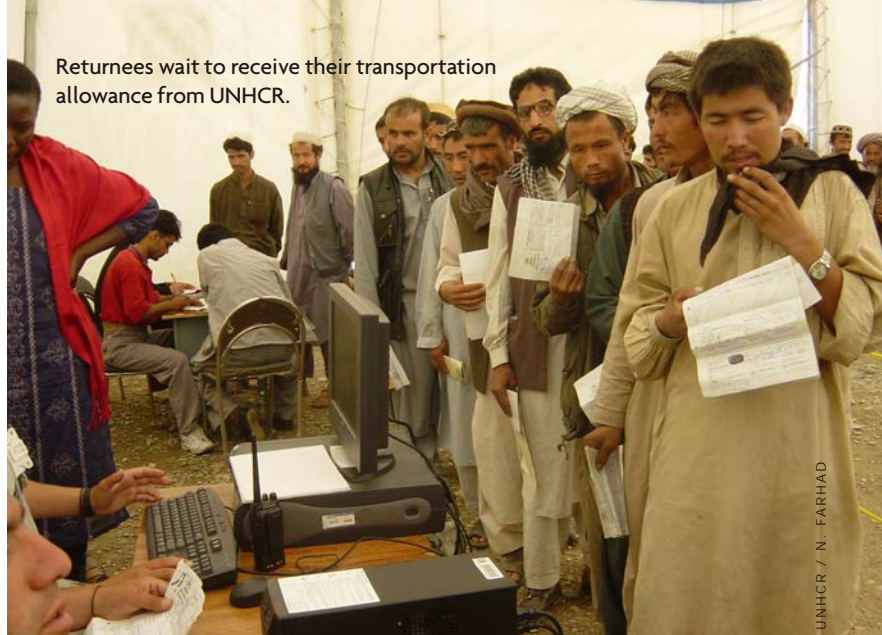
Returnees wait to receive their transportation allowance from UNHCR.

Returning refugees will receive voluntary repatriation grants of USD 150 per person. Five encashment centres will provide the grants, as well as counselling in health, legal and social issues. Returnees will also receive information about mine and ordnance risks. Following return to their place of origin, the most vulnerable returnees will be identified and assisted with an in-kind or cash grant. Legal counselling and support will be provided through a network of information centres.