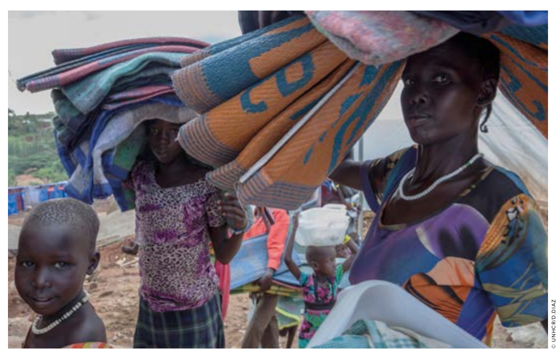
A South Sudanese mother and her children are given blankets and sleeping mats as they spend the night at a way station in Mettu, Ethiopia, before being transferred to the newly constructed camp at Gure Shembola.