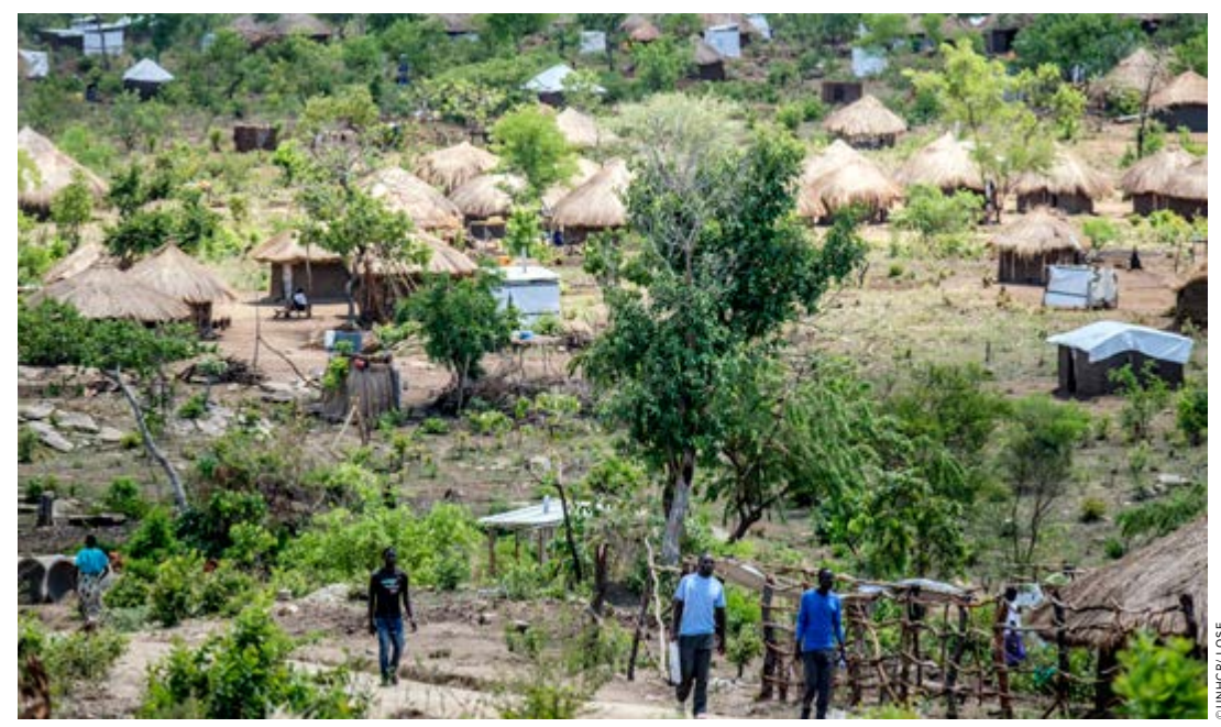
Bidibidi refugee settlement, in Yumbe District in northern Uganda, which became one of the largest such settlements worldwide.

Shelter is one of the most visible and tangible aspects of protection. Promoting access to safe and adequate shelter is critical to ensuring the protection of people of concern. In its final year of implementation, UNHCR's "Global strategy for settlement and shelter (2014-2018)" provides a framework for all operations to ensure access to dignified, secure settlements and shelter for refugees and other people of concern, irrespective of whether they live in urban or rural settings, and whether they need emergency shelter or more sustainable and durable shelter and settlement solutions.