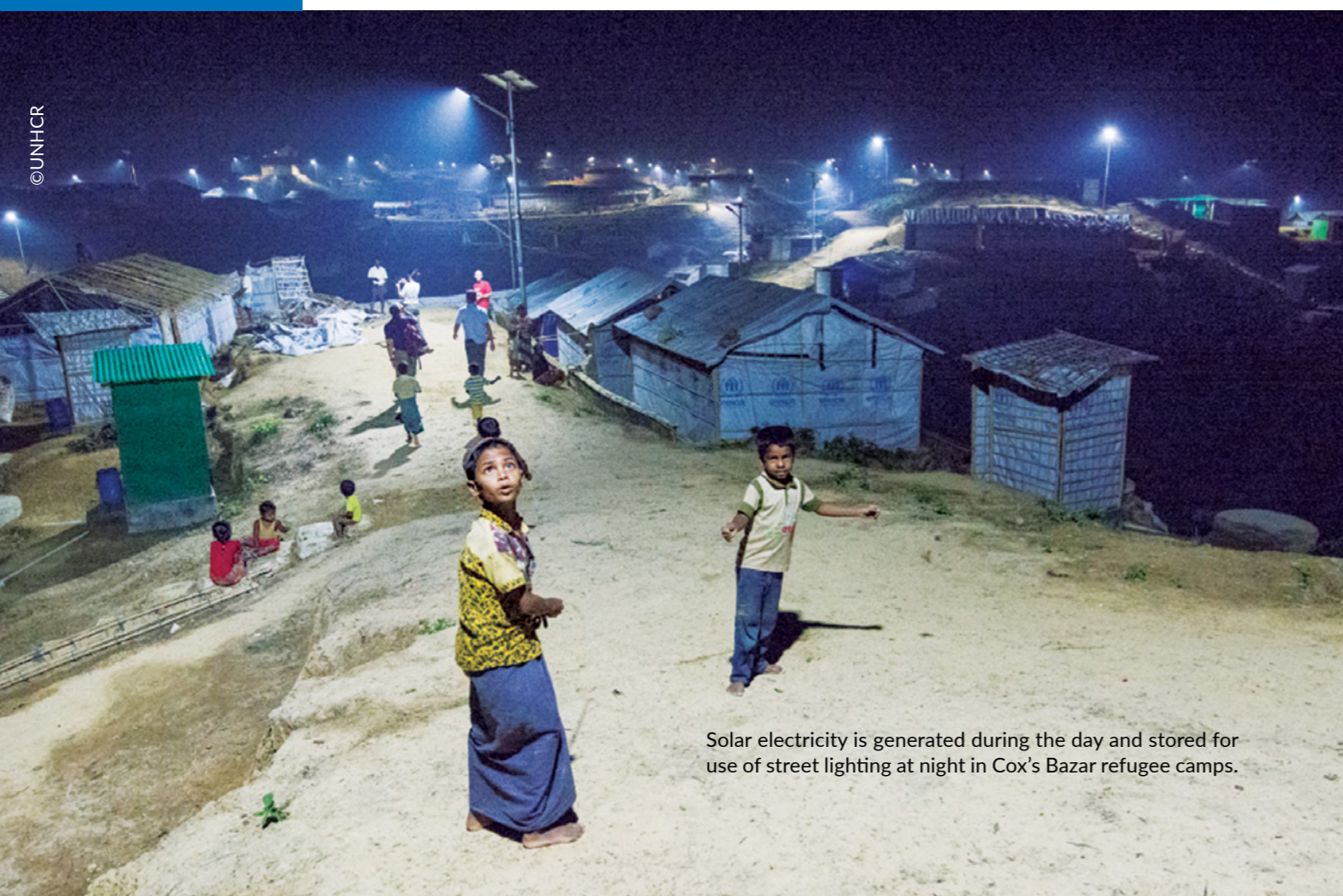
Solar electricity is generated during the day and stored for use of street lighting at night in Cox's Bazar refugee camps.