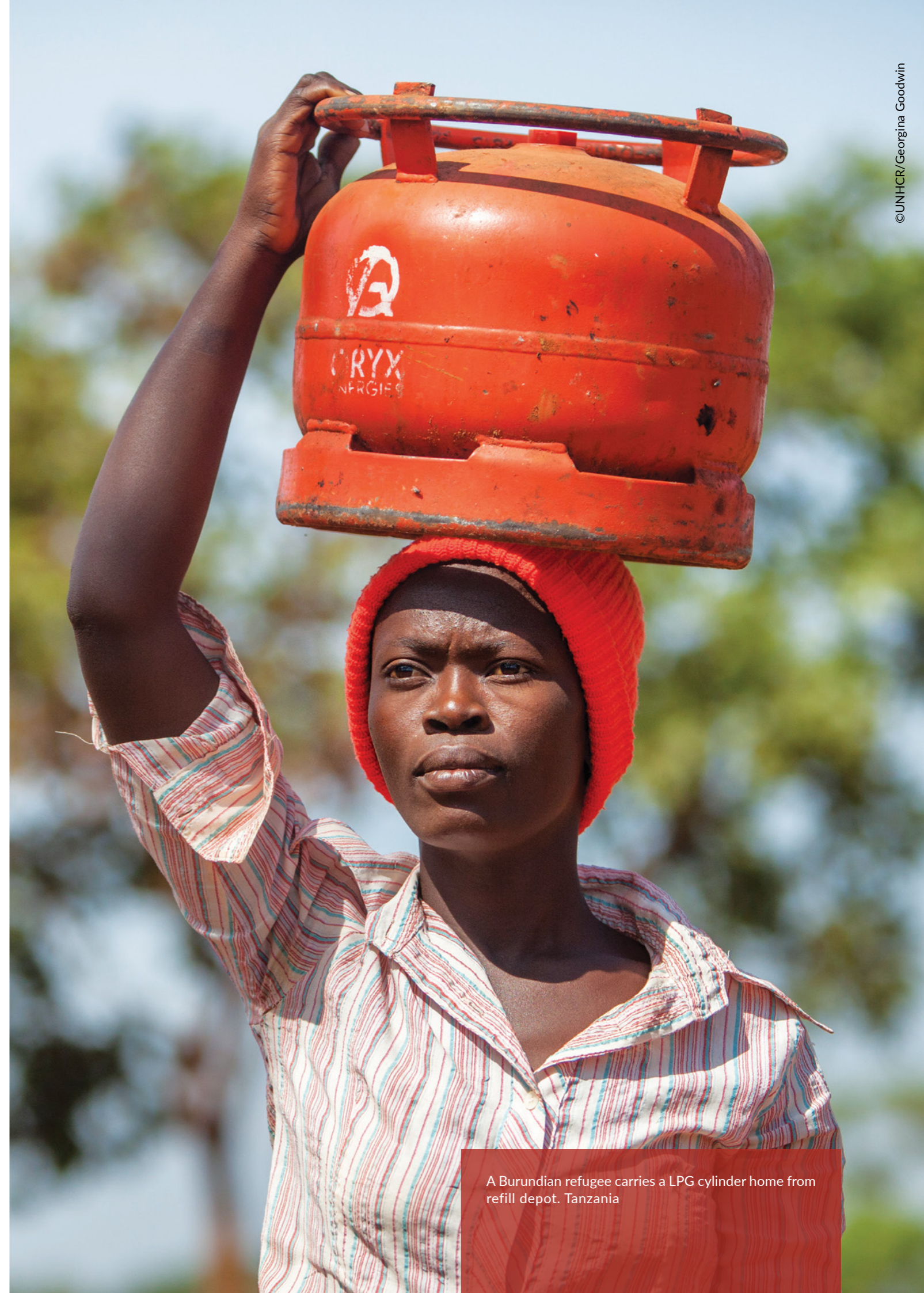
A Burundian refugee carries a LPG cylinder home from refill depot, Tanzania