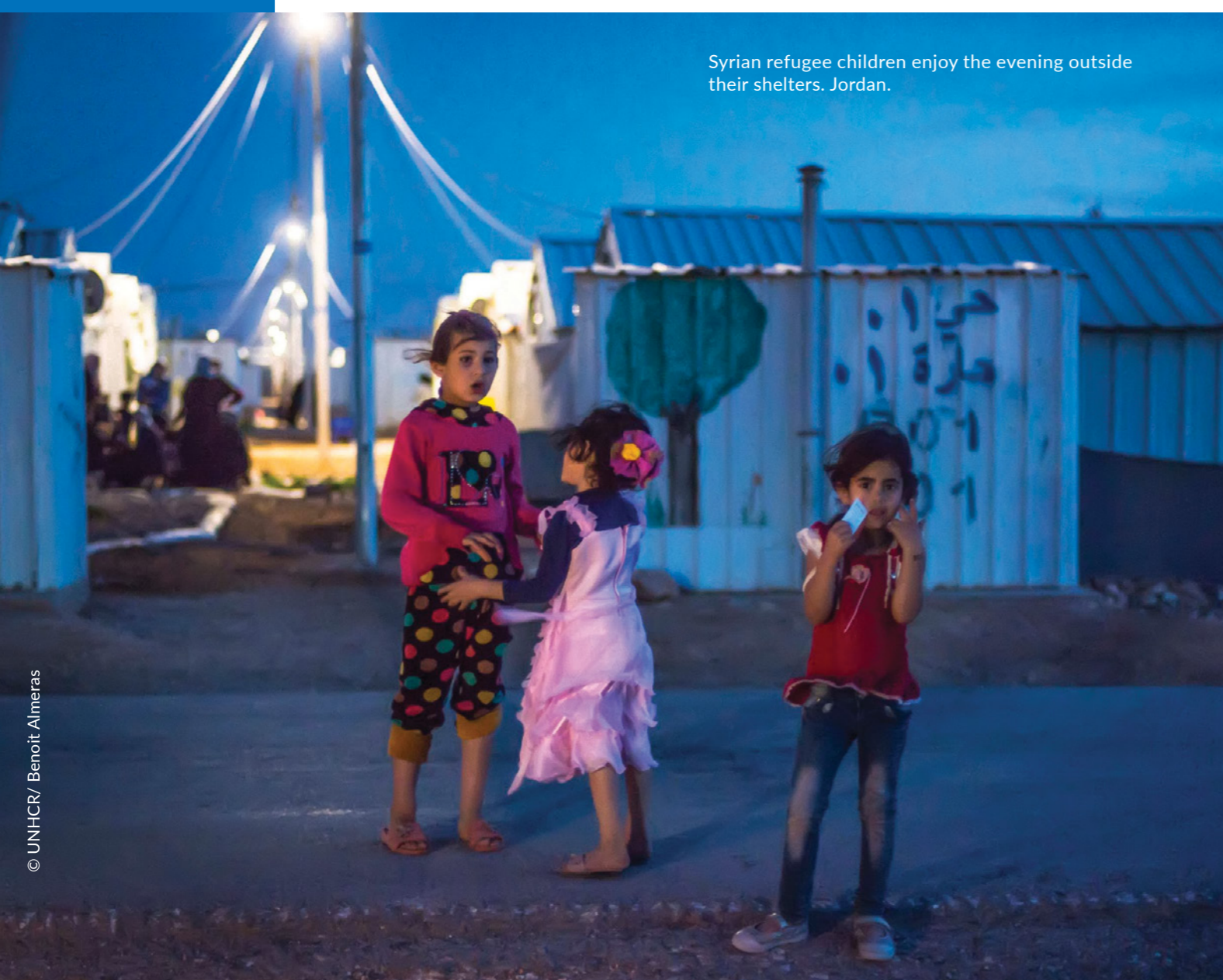
Syrian refugee children enjoy the evening outside their shelters. Jordan.

In 2017, the installation of the 2-megawatt solar photovoltaic plant near Azraq refugee camp in Jordan brought renewable power to a population that previously lived with only sporadic access to electricity. This initiative, supported by IKEA Foundation's Brighter Lives for Refugees campaign, has transformed Azraq into the world's first refugee camp powered by renewable energy. It provides affordable and sustainable electricity to approximately 40,000 Syrian refugees. Families in Azraq can now connect lights, a fridge and a TV and can charge their phones to keep in contact with relatives abroad. The construction of the Azraq solar plant has also provided an opportunity to employ skilled refugees. Fifty refugees were employed in the construction of the solar plant and 120 were employed in setting up the electrical network; on-going employment will be provided by maintenance works in the future. In Jordan, where electricity costs are high, the solar farm resulted in immediate savings of 2.75 million US$ per year, and it will cut CO2 emissions by 6,300 tons per year. As of August 2019, the plant has already been extended twice, – bringing the total plant capacity to 5 megawatts. It has also been connected to the national grid, allowing any extra clean electricity to be sent to the grid free of cost, and supporting the host community energy needs.