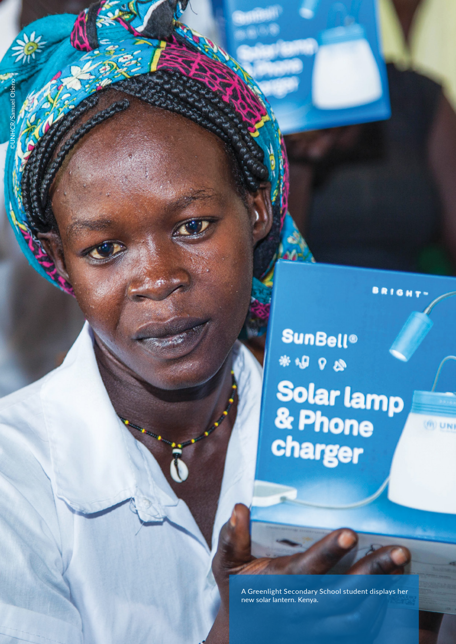
A Greenlight Secondary School student displays her new solar lantern. Kenya.