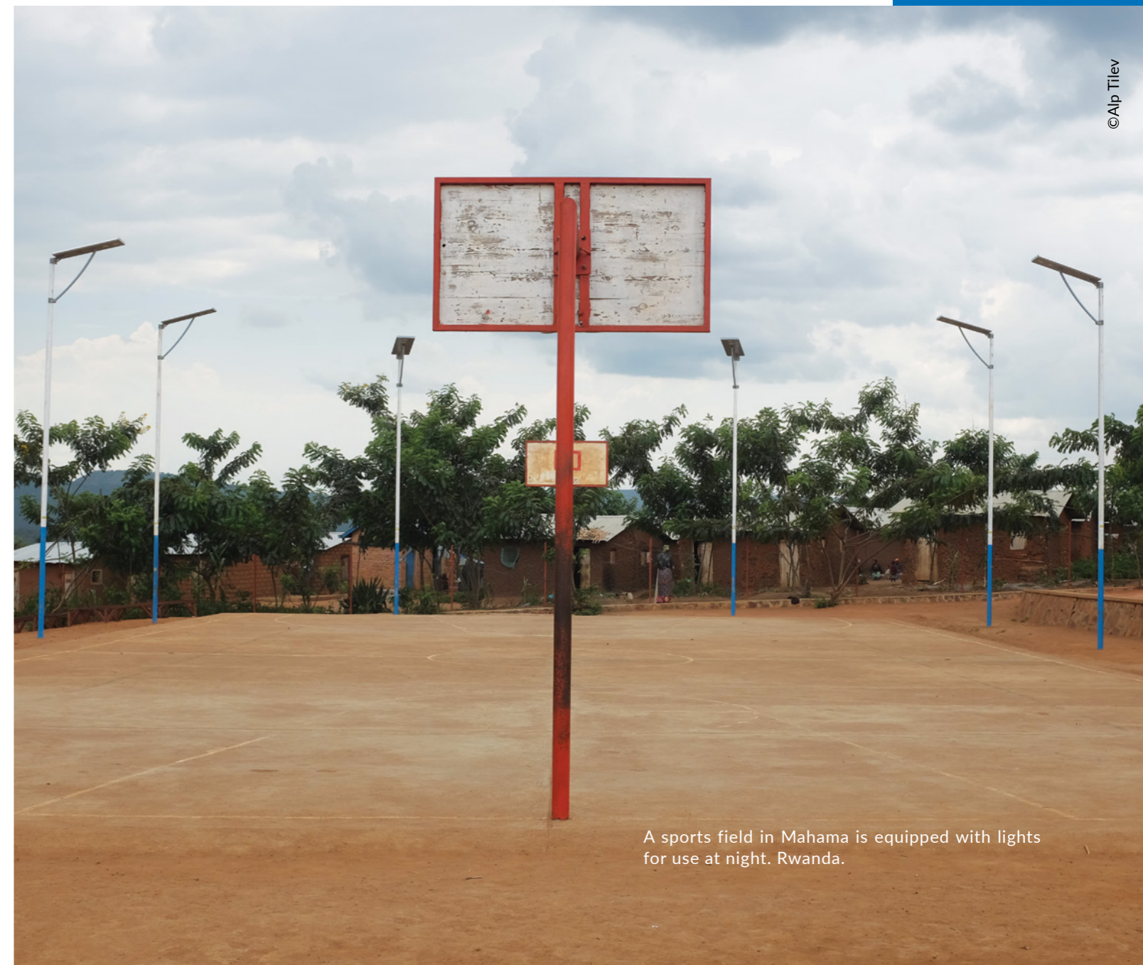
A sports field in Mahama is equipped with lights for use at night. Rwanda.

In 2017, UNHCR teamed up with the International Olympic Committee (IOC) to bring light to residents of Mahama refugee camp in Rwanda. Through IOC's "Become the light" campaign, solar lanterns were provided to 20,000 families and two major sports grounds, and selected pathways were illuminated through the installation of solar street lights and two solar mini-grid systems. Now community athletics can continue after dark, students can do their homework in the evenings and there are more opportunities for all forms of community interaction. Lighting up the camp has also significantly reduced protection risks in the camp. In order to ensure the sustainability of these initiatives, refugees participated in all stages of their development from design, through implementation where refugee technicians were trained and employed in the construction and installation of mini-grids and streetlights. The project also continues to be a source of long-term employment for trained refugees as they provide the maintenance services for the solar lighting systems.