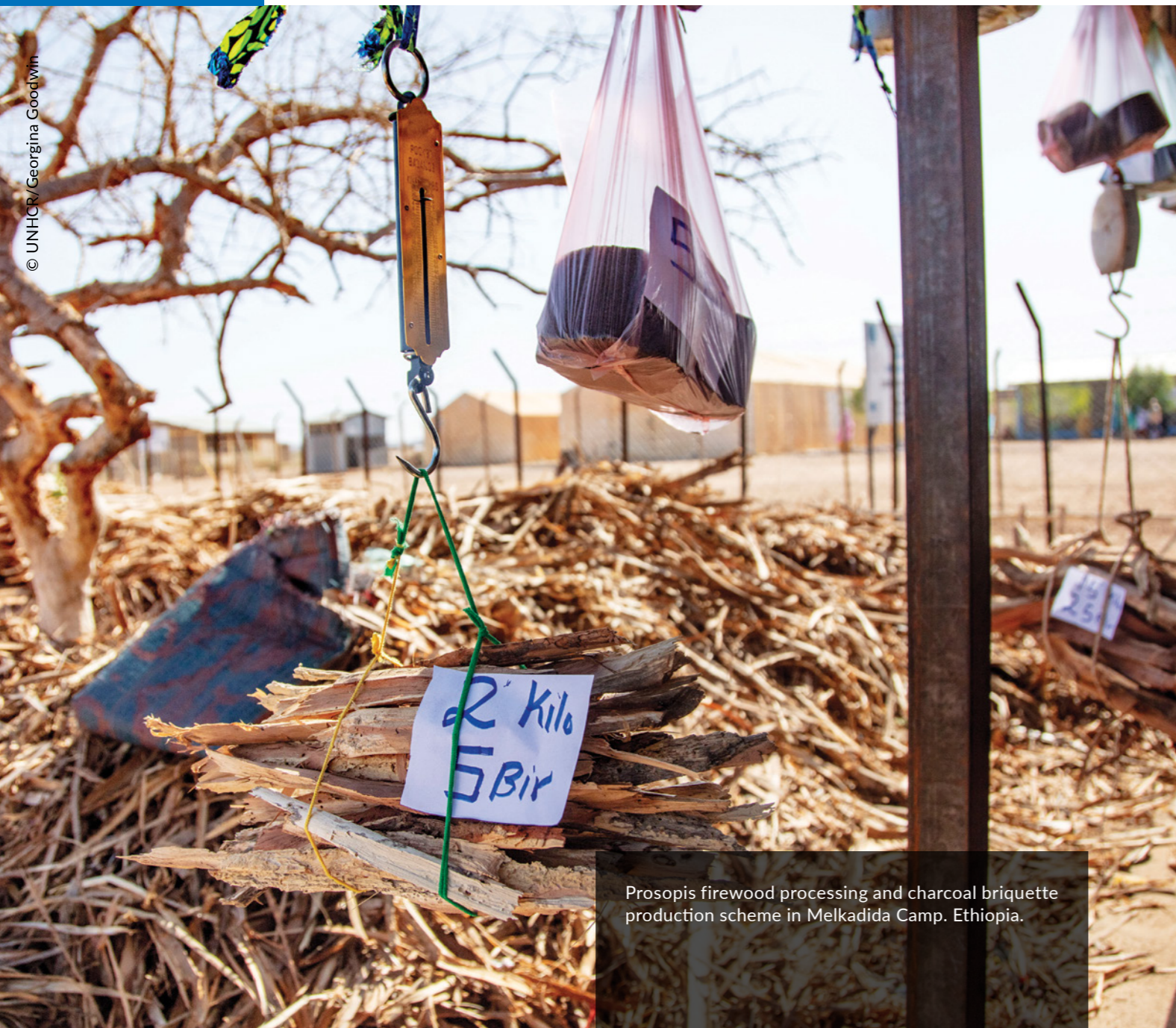
Prosopis firewood processing and charcoal briquette production scheme in Melkadida Camp, Ethiopia.

Understanding the energy needs of refugees, host communities and other stakeholders in displacement settings is a key requirement for the delivery of appropriate, clean and sustainable energy solutions. To meet this need, UNHCR is partnering with the International Renewable Energy Agency (IRENA), to gather reliable energy data and identify technically and financially sound renewable energy and energy efficiency options. In August 2019 UNHCR and IRENA worked together in Ethiopia to assess the current, and possible future, energy needs in refugee settlements. To ensure that the perspectives of refugees and host communities were considered, interviews were conducted with stakeholders at community and household levels to understand their needs for lighting, cooking and phone charging. Energy assessments were also conducted at humanitarian compounds and at service centres such as schools and health clinics. This information is now being used by UNHCR and partners to design and deliver quality energy solutions. UNHCR and IRENA will conduct further quality energy assessments in Iraq and beyond as part of a strong on-going collaboration.