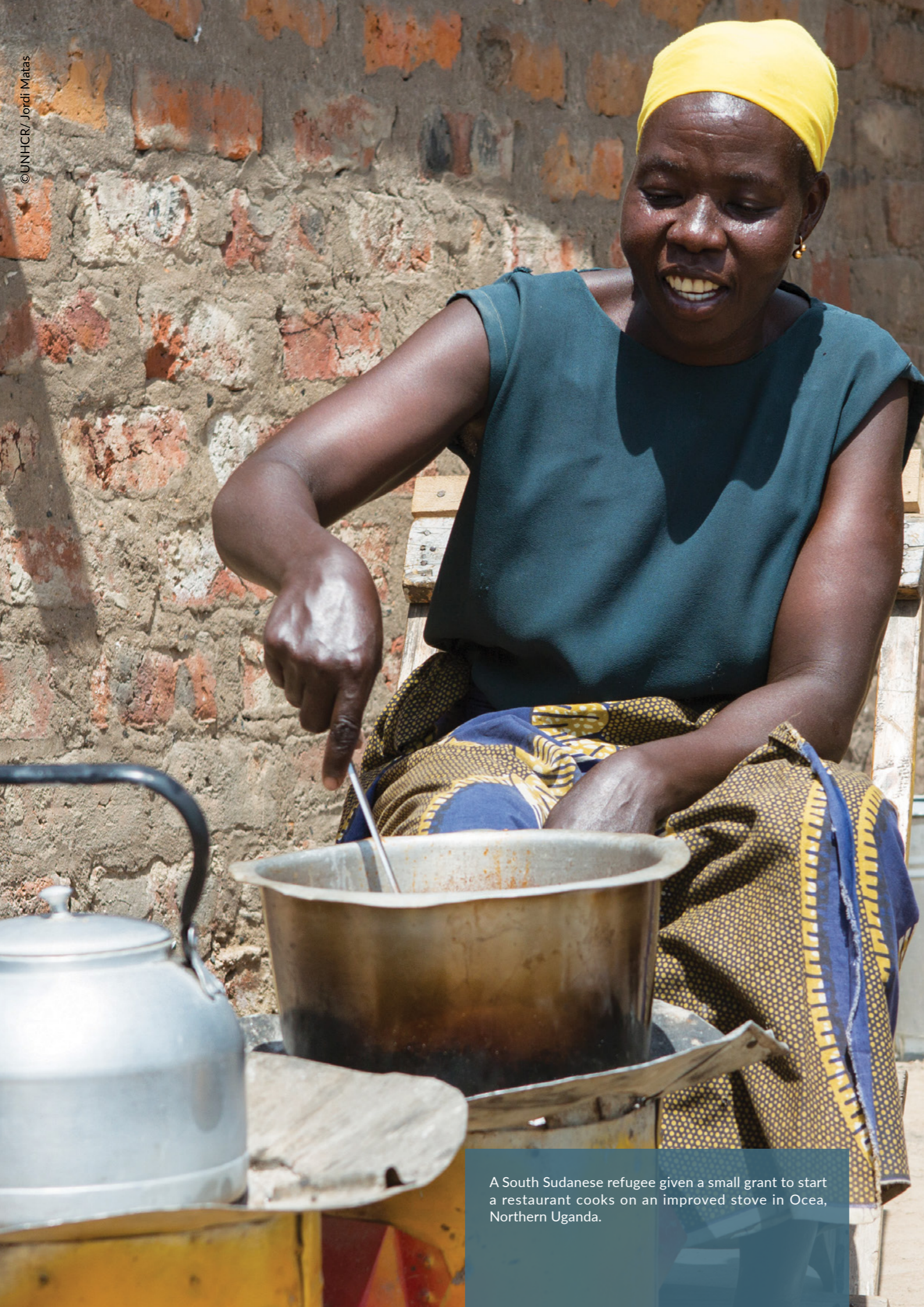
A South Sudanese refugee given a small grant to start a restaurant cooks on an improved stove in Ocea, Northern Uganda.