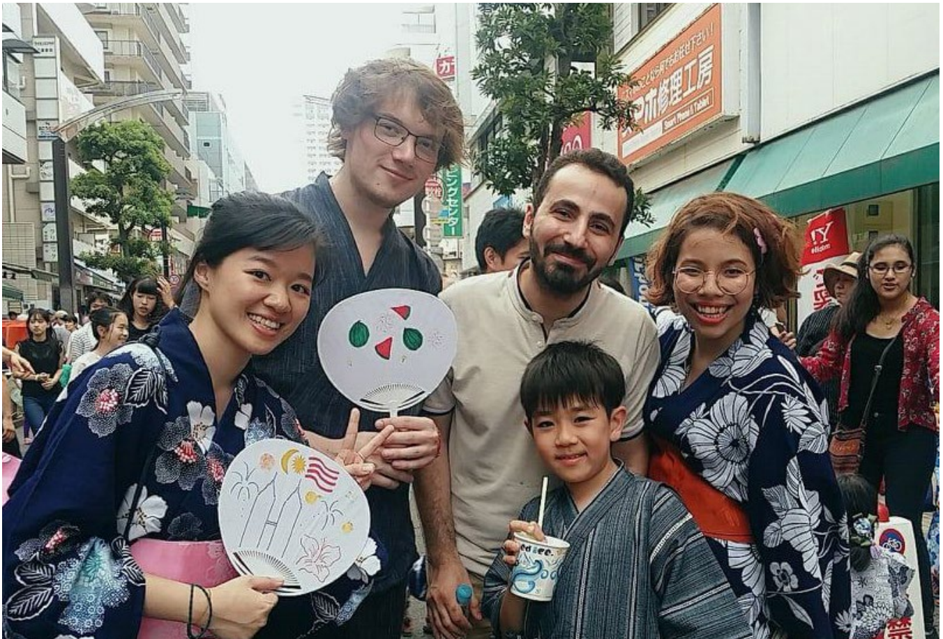
Syrian ICU student at a summer festival organized by Glocal Mitaka, a community organization, in Tokyo, July 2019