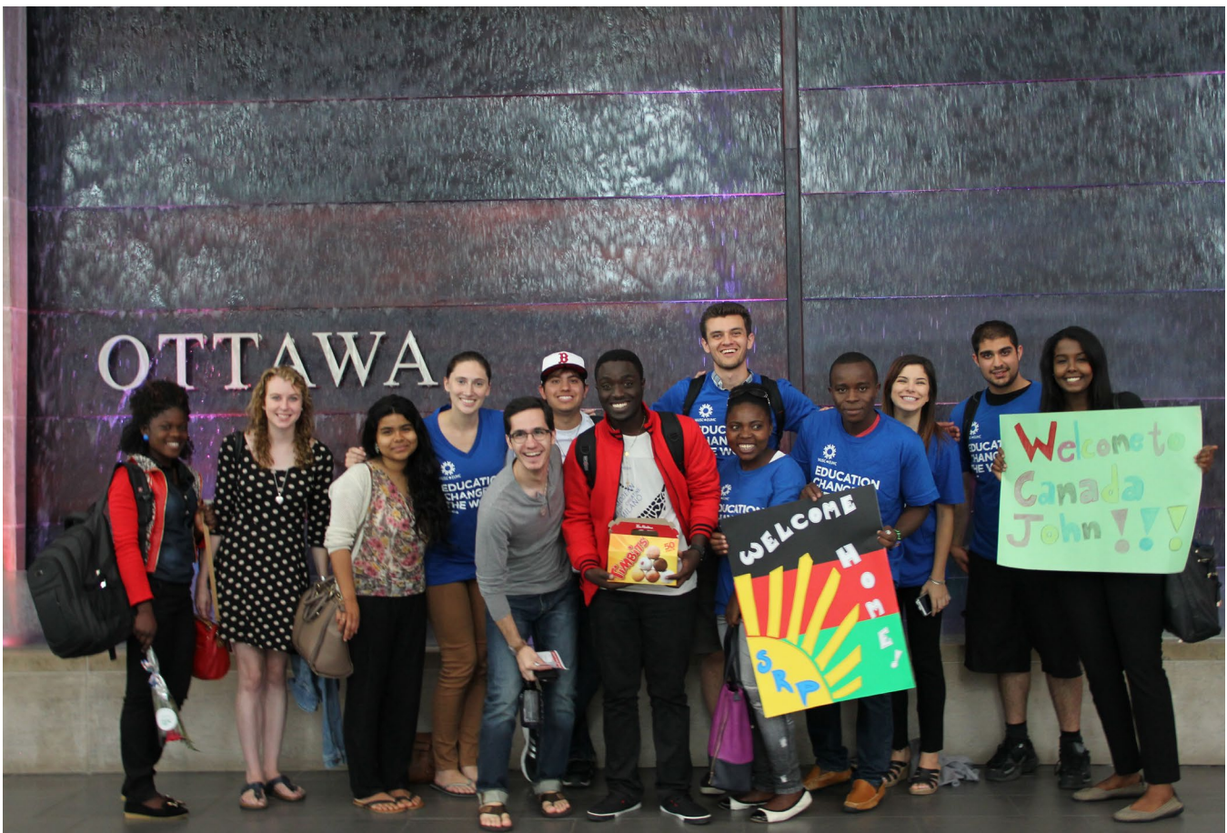
University of Ottawa and Carleton University students welcome a new cohort of refugee students resettled to Canada through the SRP in 2015

To ensure that these initiatives are a success, engage host community students and communities . Local communities and students should be involved in the development and planning for education pathways programs to the greatest extent possible. Community ownership can help to minimize perceptions of refugee students as a threat or unwelcome. Higher education institutions should build strong partnerships with student groups and support campus engagement, public awareness and refugee and host community integration.