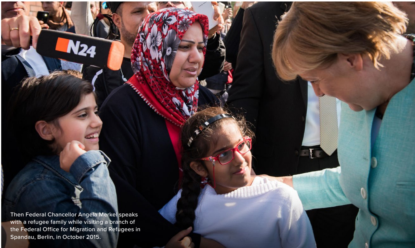
Then Federal Chancellor Angela Merkel speaks with a refugee family while visiting a branch of the Federal Office for Migration and Refugees in Spandau, Berlin, in October 2015.