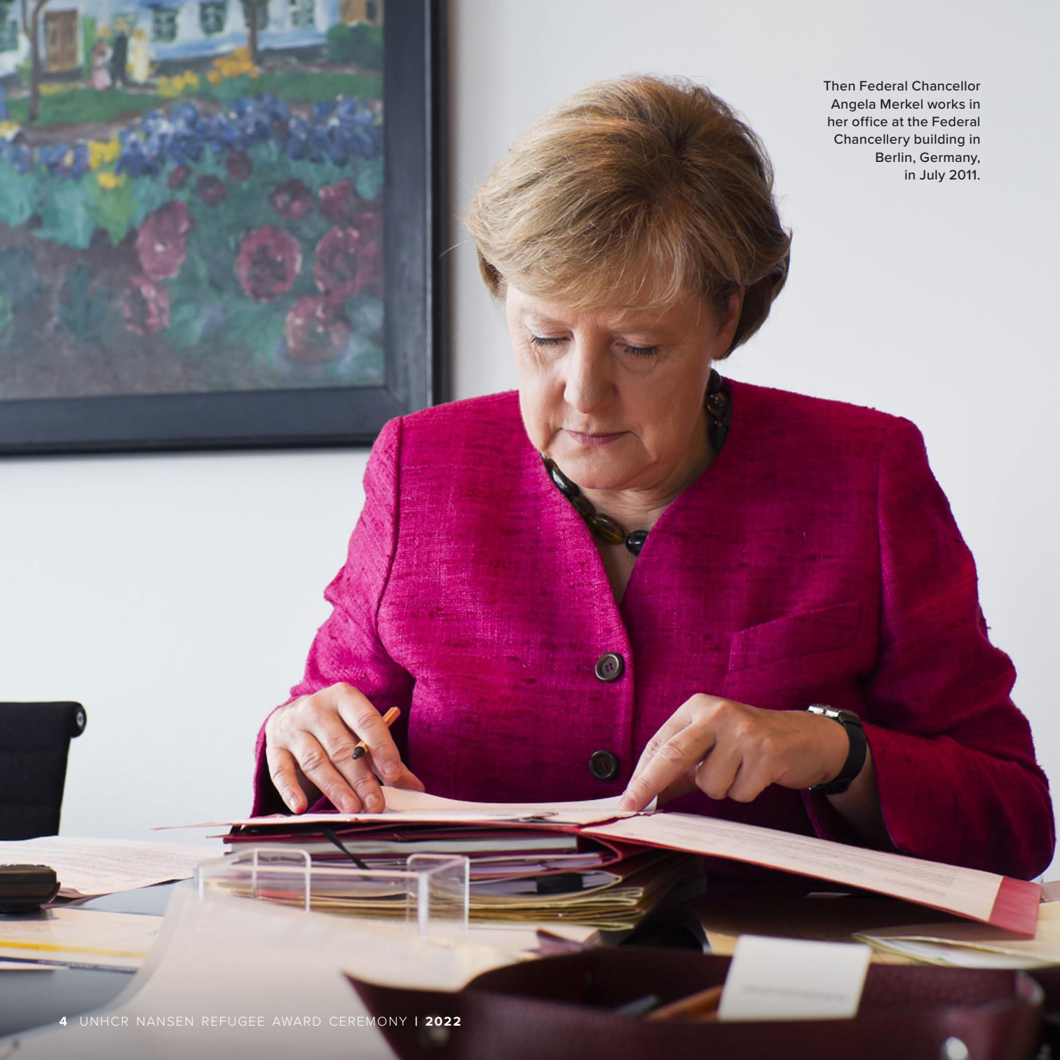
Then Federal Chancellor Angela Merkel works in her office at the Federal Chancellery building in Berlin, Germany, in July 2011.