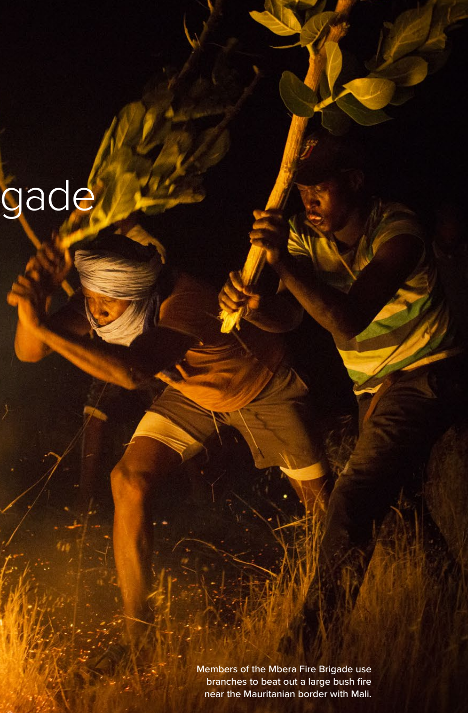
Members of the Mbera Fire Brigade use branches to beat out a large bush fire near the Mauritanian border with Mali.

“We are volunteers because we have to [be]. The bushfire is a predator to us. If we don’t go to put it out, it will burn the camps, it will burn the goats, it will burn the grass.”