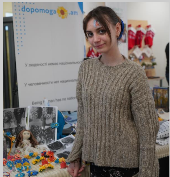
A refugee woman from Ukraine offers traditional Ukrainian handmade souvenirs at a Christmas craft-sale in Yerevan, Armenia, 17 December 2022.

In February 2023, the Mayor of Vardenis joined the campaign- by signing a Statement of Solidarity with refugees, thus becoming the sixth city in Armenia pledging solidarity with forcibly displaced people residing in their city.