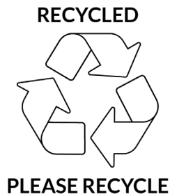
Graphic 1: Recycled Paper Symbol

Every box made of recycled paper must have a symbol about its recycled nature and the possibility to be recycled (see Graphic 1):