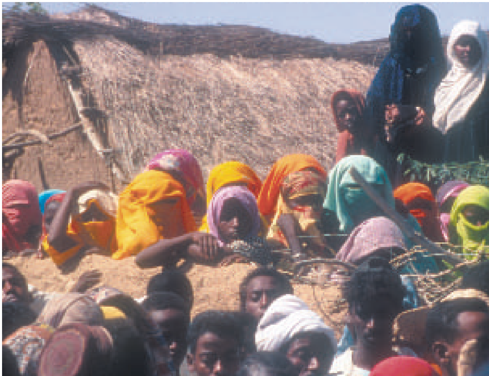
Eritrean refugees gathered to wait for the High Commissioner's visit in November 2003.

In a joint mission, UNHCR and COR identified 1,556 Congolese refugees who expressed their willingness