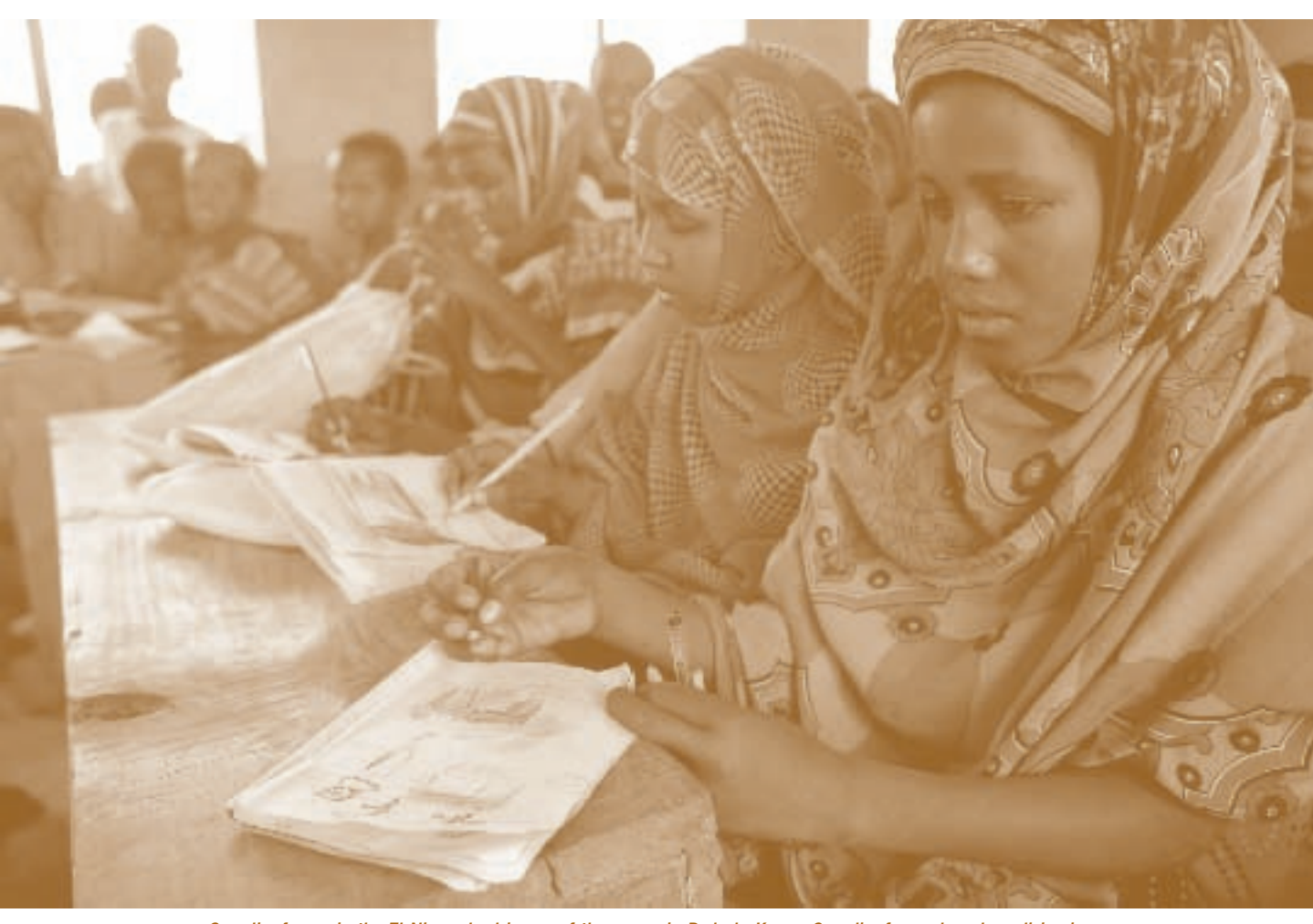
Somali refugees in the El Nino school in one of the camps in Dadaab, Kenya. Somali refugees have been living in these camps since they were set up in 1991. (UNHCR/B. Press/July 1999)

drawn from past experience to develop a more systematic approach to comprehensive solutions.<sup>38</sup>