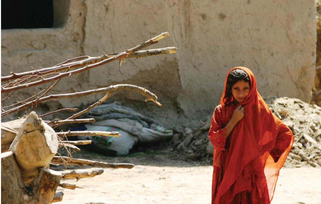
A young returnee who just arrived in Afghanistan from the tribal areas of Pakistan.