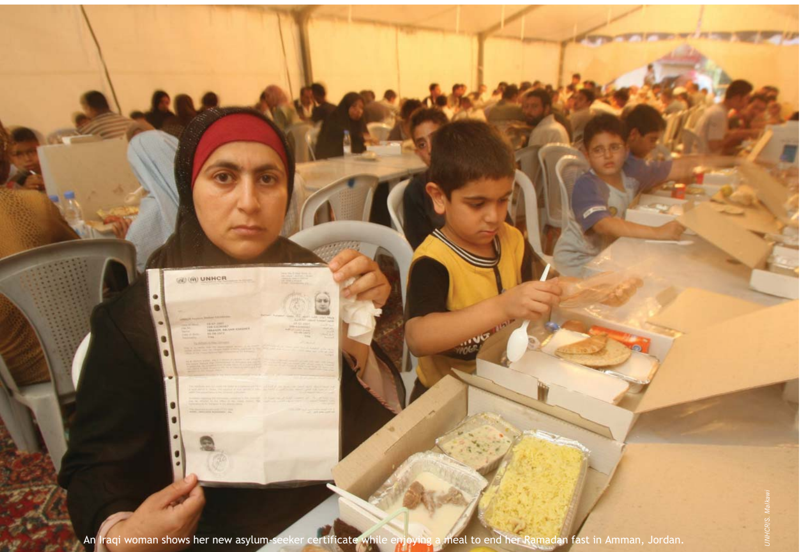
An Iraqi woman shows her new asylum-seeker certificate while enjoying a meal to end her Ramadan fast in Amman, Jordan.

The volatile security situation inside Iraq, significant increases in the prices of commodities, high unemployment rates and the lack of self-reliance opportunities, as well as instability and extremist threats, constrain the delivery of UNHCR's programmes both in Iraq and in the refugee hosting countries.