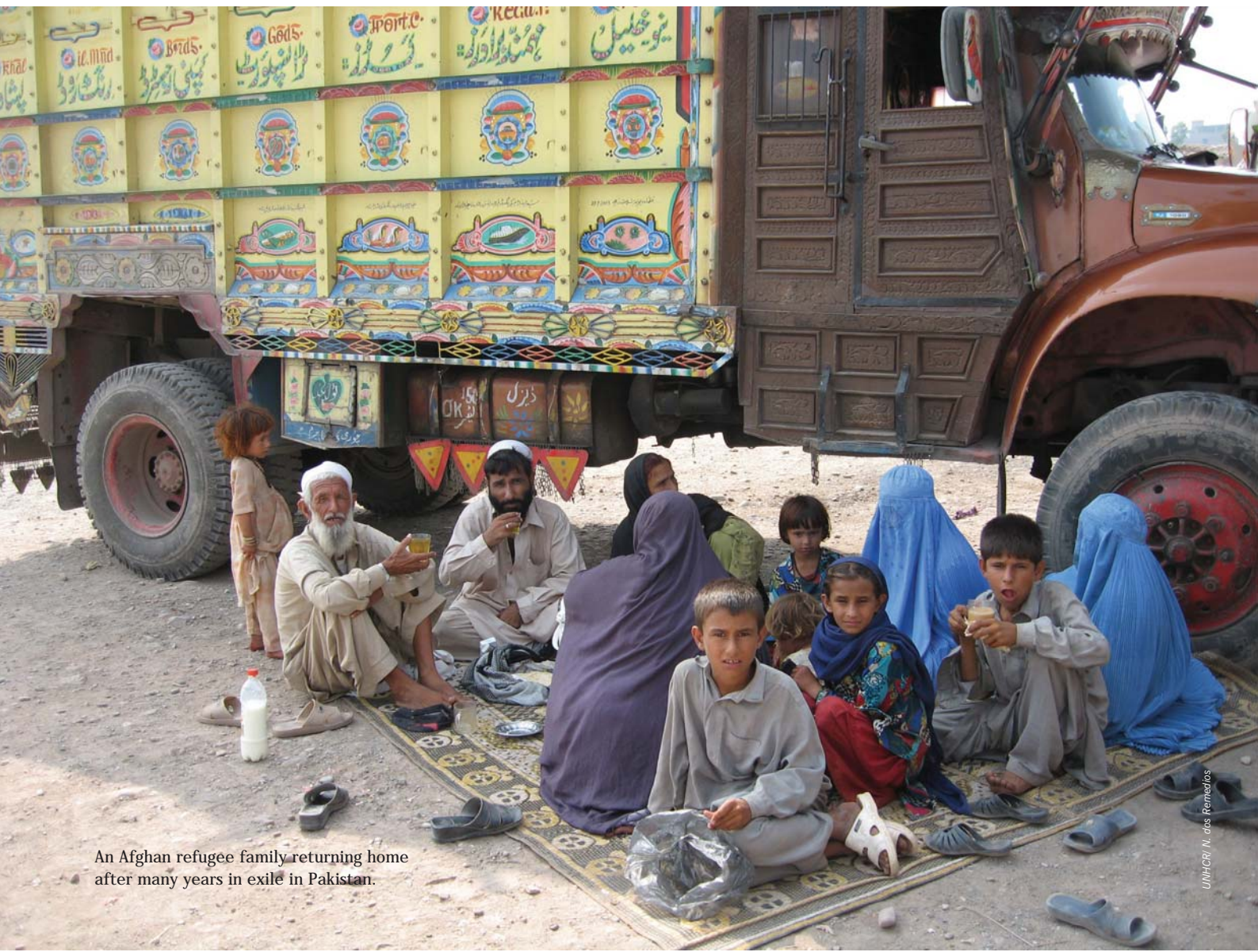
An Afghan refugee family returning home after many years in exile in Pakistan.

The Afghanistan operation was mainstreamed into the annual programme in 2004, with the budget decreasing to reflect declining returns. Natural disasters in Pakistan such as the earthquake of 2005 and floods in 2007