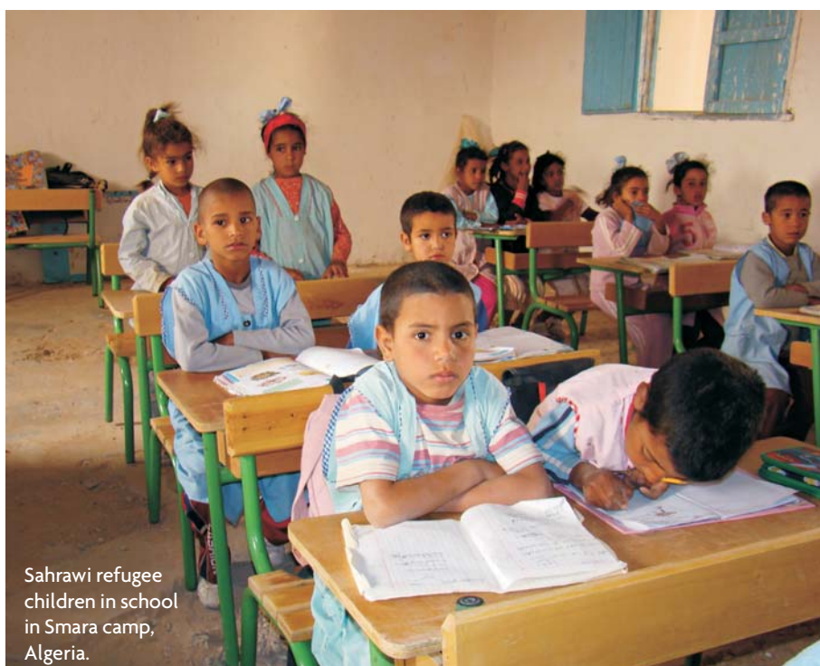
Sahrawi refugee children in school in Smara camp, Algeria.