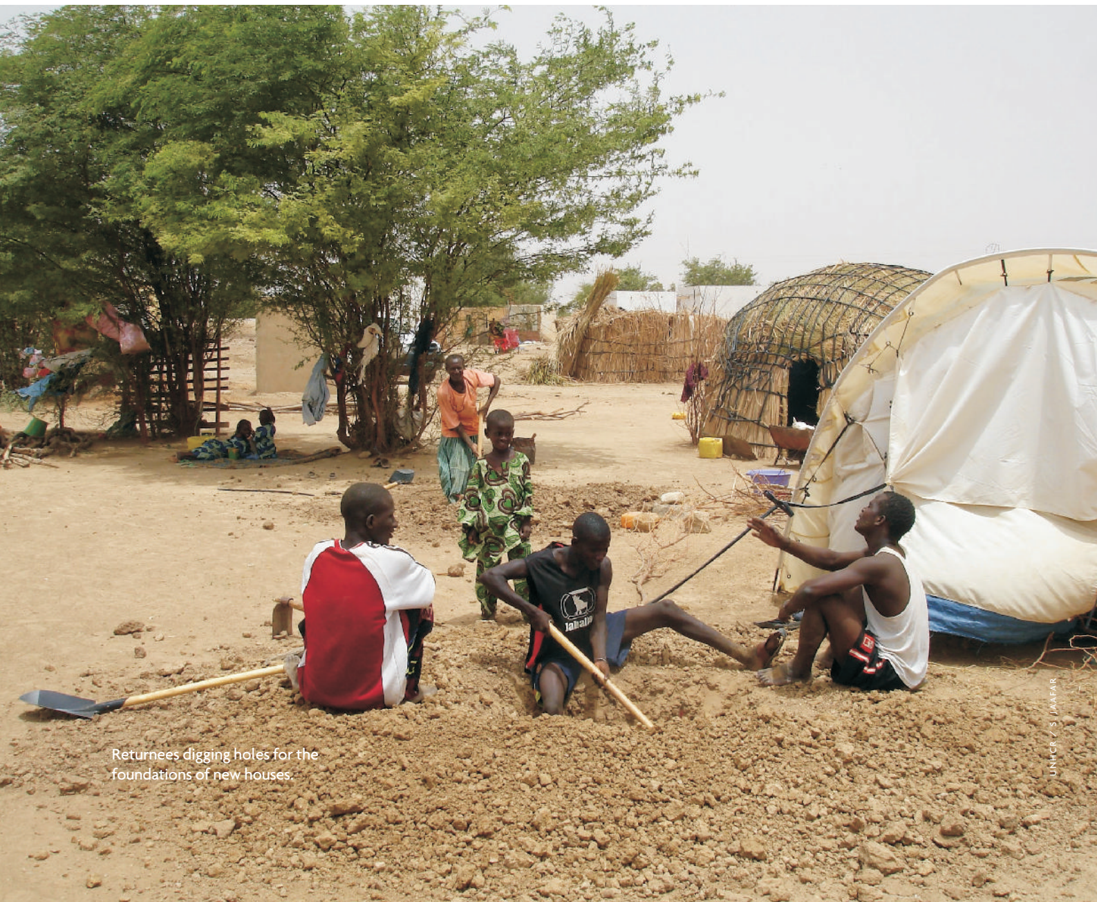
Returnees digging holes for the foundations of new houses.

In view of the inadequate conditions in areas of return, including shortages of potable water, general food insecurity, lack of health and educational facilities, and low agricultural productivity, UNHCR aimed to improve the living conditions of both returnees and host communities through its reintegration programme and through coordination with the authorities and NGOs.