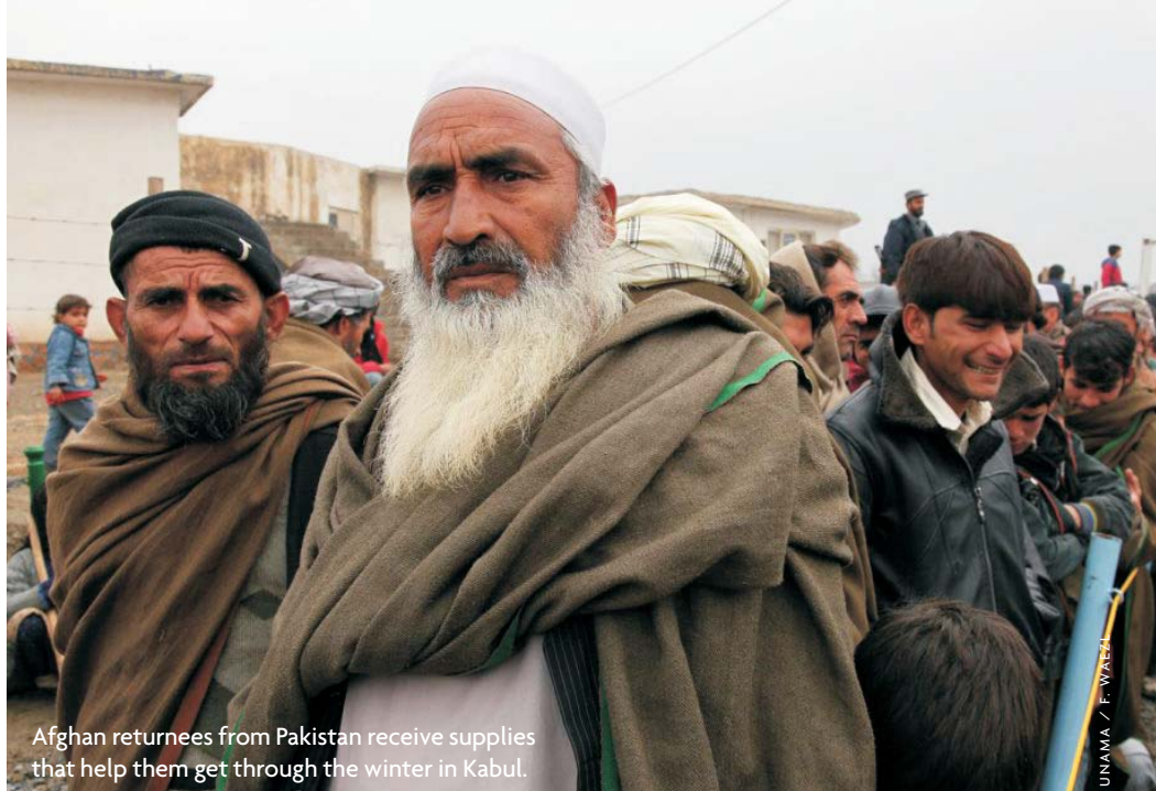
Afghan returnees from Pakistan receive supplies that help them get through the winter in Kabul.

With regard to internally displaced persons (IDPs), UNHCR is focusing both on those who have been displaced for a long time and on those more recently uprooted. Afghanistan also hosts a small number of refugees and asylum-seekers, mostly from the Islamic Republic of Iran, Iraq and Pakistan. In the absence of a national capacity, UNHCR carries out refugee status determination (RSD) and has succeeded in resettling a small number of these refugees.