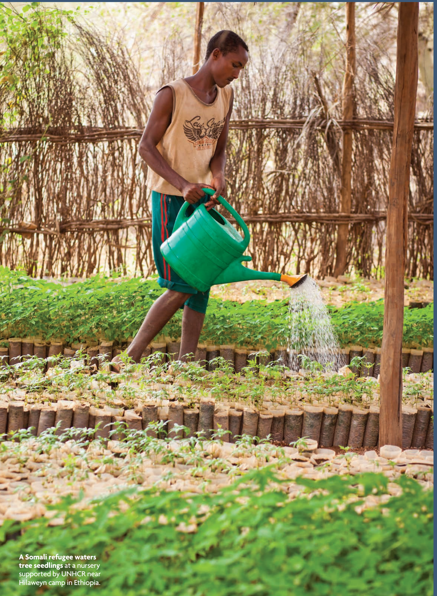
A Somali refugee waters tree seedlings at a nursery supported by UNHCR near Hilaweyn camp in Ethiopia.