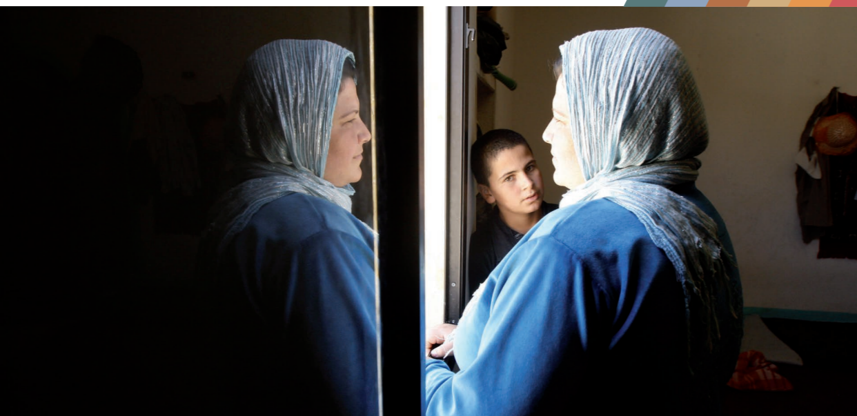
UNHCR / A. Branthwaite / September 2012

Through its Key Initiatives, UNHCR's Division of Programme Support and Management (DPSM) shares regular updates on interesting projects that produce key tools, practical guidance and new approaches aimed at moving UNHCR operations forward.