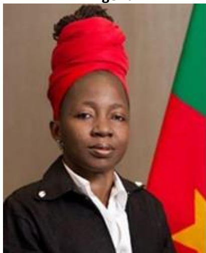
Kah Walla Nigeria

Kah Walla launched a pilot program with women sellers in one of the largest produce markets of Douala, where 900 women traders had no voice in market operations. Through the program, women sellers formed an association to advocate collectively for improved conditions, elimination of double-taxation and for the creation of a level playing field for women in the marketplace. For 25 years, Kah has focused on good governance, the rights of women and youth and the rule of law. She has worked with civil society in Cameroon and throughout Africa, developing policies and projects at international, national and local levels with farmers, traders, motorbike drivers, persons with disabilities, fishermen, student associations, and governments. In 2008, she was one of 7 women entrepreneurs in Africa profiled in the report, Doing Business: Women in Africa , released as part of a joint effort between the Doing Business project and the World Bank's Gender Action Plan.