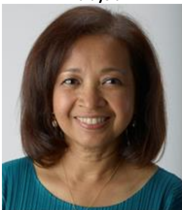
Marina Mahathir Malaysia

Marina Mahathir is a Malaysian socio-political activist and writer. She began her career in advocacy in the HIV/AIDS sector. A graduate of the University of Sussex, she was president of the Malaysian AIDS Council (MAC) for more than a decade, and was also chairperson of the Malaysian AIDS Foundation (MAF). Through her work with the MAC and MAF, Mahathir came into contact with numerous vulnerable groups, such as the transgender community, drug users, sex workers, migrant workers and people with HIV. After leaving her position as MAC president in 2006, Mahathir went on to focus on issues related to Islam and gender, and was a board member of Sisters in Islam, which advocates for justice and equality for Muslim women in Malaysia. In 2010, she was awarded UN Person of The Year in Malaysia for her achievements in gender and women's empowerment and in HIV/AIDS work both in Malaysia and internationally.