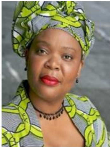
Leymah Gbowee Liberia

Liberian social worker and peace activist Leymah Gbowee is best known for her leadership in the grassroots women's movement for peace during Liberia's civil war. Gbowee was awarded the Nobel Peace Prize along with her collaborator and Liberian President Ellen Johnson Sirleaf in 2011 for their non-violent struggle for the safety of women and for women's rights to full participation in peace-building work. In 2006 she co-founded the Women Peace and Security Network Africa, which she led as the Executive Director for 6 years. In 2011 she founded the Gbowee Peace Foundation Africa in Monrovia, an organisation which provides education and leadership development opportunities for women and girls. In addition to her master's degree in Conflict Transformation, Gbowee has been the recipient of many honorary doctorates and other distinctions. Her story was featured in the award-winning film Pray the Devil Back to Hell (2008) on the civil war in Liberia. In 2011 she published her memoir, Mighty Be Our Powers .