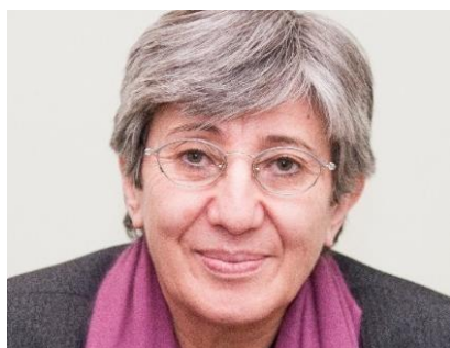
Sima Samar Afghanistan

Sima Samar is former head of the Ministry of Women's Affairs in Afghanistan and is a recognized woman's and human rights activist. Educated as a medical doctor in Afghanistan, Samar spent 17 years in Pakistan after fleeing in 1979. Upon her return, she founded The Shuhada Organisation, an NGO which now supports schools, clinics and hospitals both in Afghanistan and Pakistan. She currently serves as the Chairperson for the Afghan Independent Human Rights Commission and the UN Special Rapporteur for Human Rights in Sudan. Samar has been recognized globally for her work on women's rights and has received many prestigious awards.