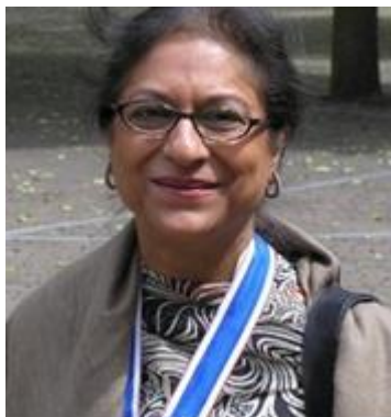
Asma Jahangir Pakistan

Asma Jahangir is a founding member of the Human Rights Commission of Pakistan and a leading human rights lawyer. For three decades she has worked to defend the most vulnerable Pakistanis – women, children, religious minorities and the poor. Jahangir founded the first legal aid centre in Pakistan in 1986, and has campaigned against laws that discriminate against women. She was elected as the first female President of the Supreme Court Bar Association of Pakistan in 2010. She co-chairs the South Asia Forum for Human Rights, served as UN Special Rapporteur on Freedom of Religion or Belief, and currently serves on the UN Investigation on Sri Lanka to examine human rights violations there. Jahangir is also a laureate of the Right Livelihood award.