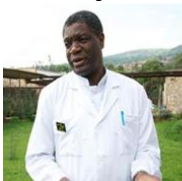
Denis Mukwege Democratic Republic of Congo

Denis Mukwege is a Congolese gynecologist and the founder and medical director of Panzi Hospital in the DRC. The hospital has become known worldwide for the treatment of survivors of sexual violence as well as for providing services to more than 30,000 rape survivors. In addition to medical treatment, the hospital provides legal and psychosocial services to its patients. Dr. Mukwege serves on the advisory committee for the International Campaign to Stop Rape and Gender Violence in Conflict. Aside from his medical work, Mukwege has become a leading advocate for women's rights both within DRC and internationally. He has received many awards for his work, including the Sakharov Prize for Freedom of Thought (2014), the Clinton Global Citizen Award (2011), the King Baudouin International Development Prize (2011) and the Right Livelihood Award (2013).