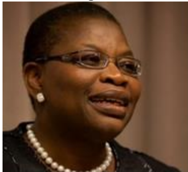
Obiageli Ezekwesili Nigeria

Dr. Obiageli ‘Oby’ Ezekwesili is a Senior Economic Advisor with Africa Economic Development Policy Initiative. Dr. Ezekwesili is also co-founder of the #BringBackOurGirls citizens’ movement advocating for the safe rescue of the abducted 219 school girls of Chibok community in Born State, Northern Nigeria. She served as the Vice President of the World Bank in Washington, D.C. where she was responsible for operations in 48 countries and a lending portfolio of nearly $40 billion. From 2002 to 2007, Dr. Ezekwesili worked for the federal government of Nigeria as Minister of Education, Minister of Solid Minerals, head of the Budget Monitoring and Price Intelligence Unit as well as Chairperson of the Nigeria Extractive Industries Transparency Initiative. She is a founding Director of Transparency International, representing Africa at the global anti-corruption body based in Berlin. Dr. Ezekwesili was named one of 2015 Time Magazine’s 100 Most Influential People in the World and 50 Most Powerful Africans by the New Africa Magazine. Dr. Ezekwesili was also named as one of the New York Times’ 2015 Women of Impact.