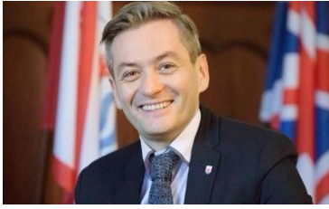
Robert Biedroń Poland

Robert Biedroń is an LGBTI activist and founder of the Campaign Against Homophobia in Poland, which has developed strong advocacy and community mobilization approaches despite a very conservative political context at the national level. Biedroń has a strong background in human rights and is well known within the Polish civil society and human rights movements. He is a former member of the Polish Parliament and was recently elected as the first openly gay mayor of Slupsk, Poland.