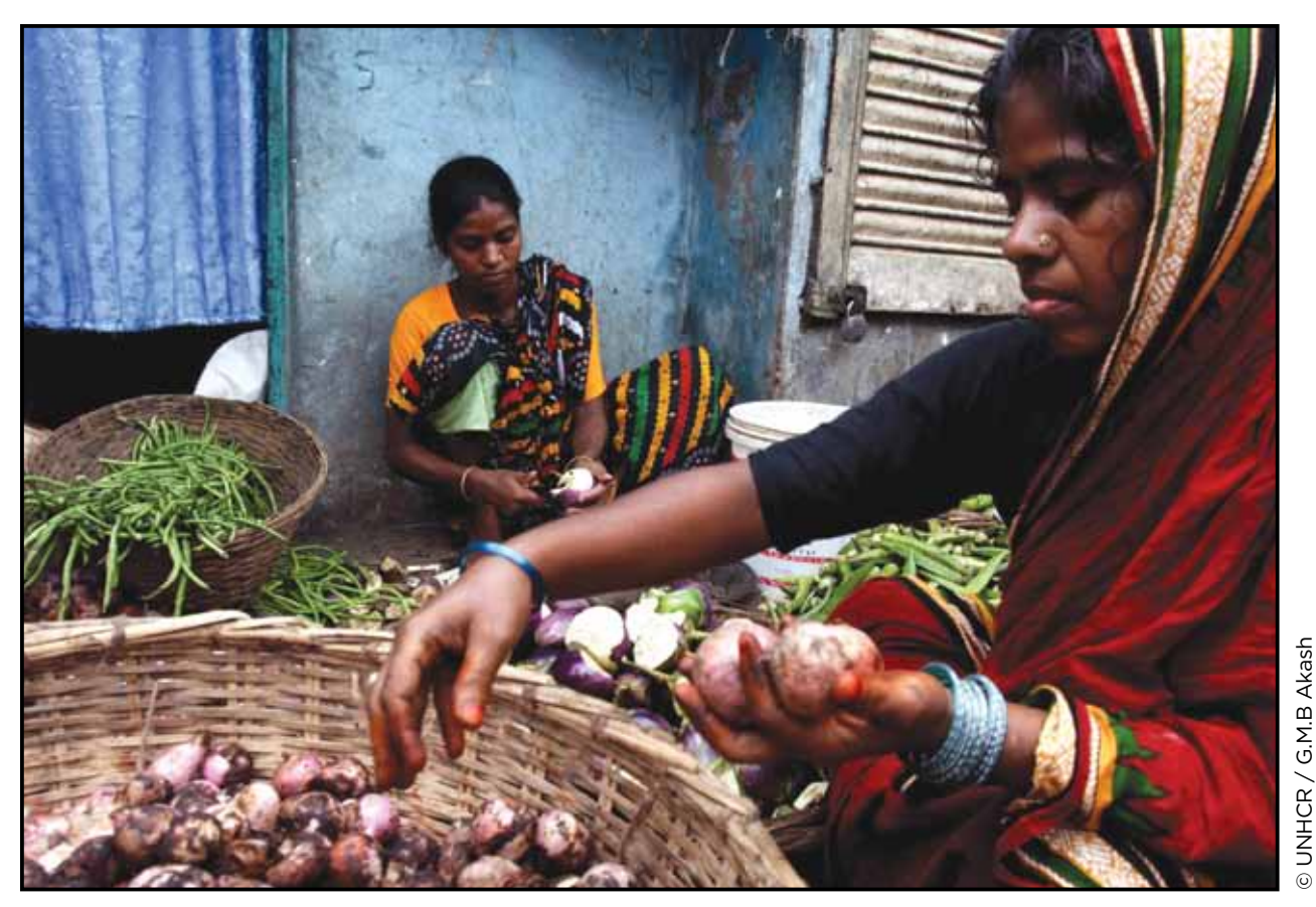
Women selling turnips in a market in Dhaka, Bangladesh. These women were members of a group of Urdu speakers who were stateless for decades until a 2007 landmark court decision that reconfirmed their Bangladeshi citizenship.

fruits of this endeavor, a number of States took action, made commitments to take action, or both, to enhance the protection of stateless individuals. The United States made two pledges at the UNHCR December 2011 Ministerial Meeting that relate specifically to the issues addressed in this report—to review administrative measures that can be taken to increase the protections accorded to stateless individuals in the U.S. and to encourage and support efforts to enact legislation providing a means of attaining lawful permanent residence and ultimately U.S. citizenship to eligible stateless individuals.14 This report, the first presentation of the circumstances and concerns of stateless individuals in the United States, is intended to further those efforts and provides clear recommendations for fulfilling the pledges made by the U.S. Government.