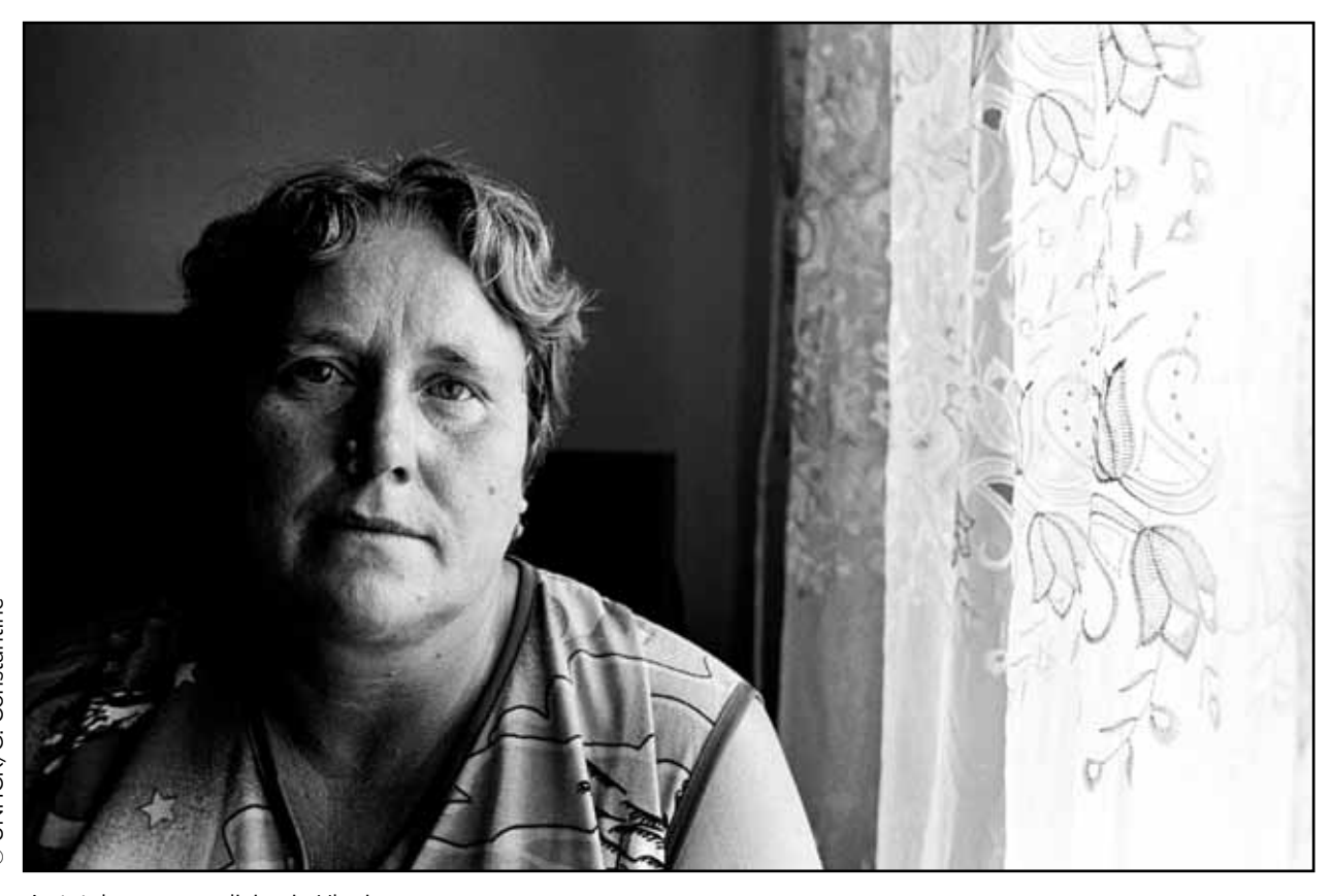
A stateless woman living in Ukraine.

Although there may be some aspects of U.S. law that would need to be reconciled with the obligations under the 1954 Convention, this is surmountable, and acceding to the Convention would be a strong and vital step in demonstrating nationally and globally the United States' commitment to ensuring that the treatment of stateless persons on U.S. territory adhere to important minimum standards. Accession to the 1954 Convention would also invoke a statelessness status determination procedure which is a prerequisite for ensuring that a State can identify those who are stateless and, thus, in need of protection.