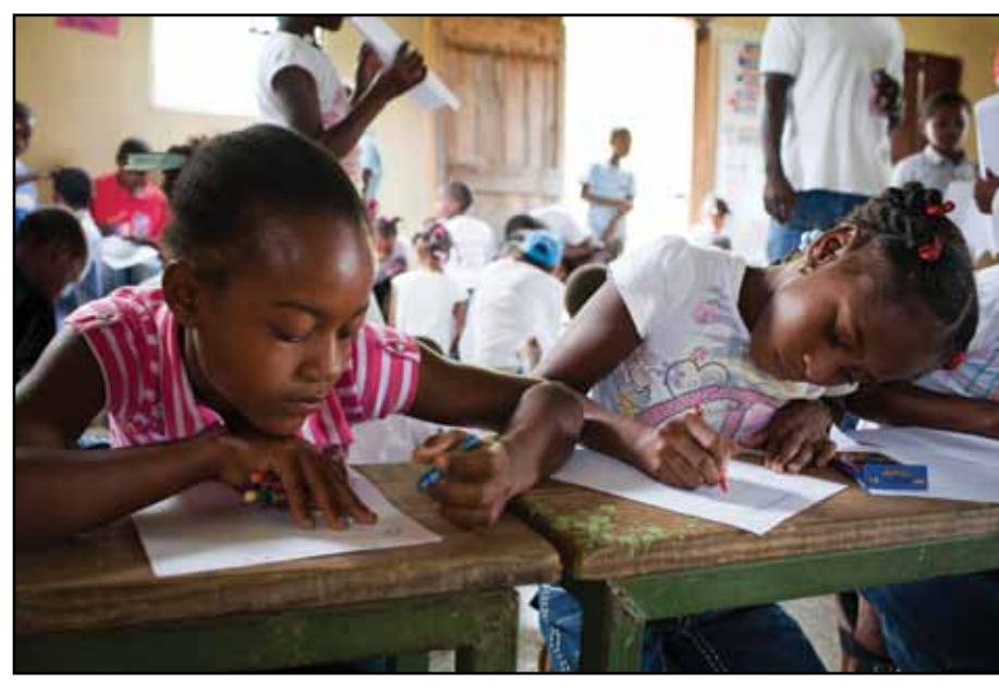
Children make drawings as part of a protection workshop run by Plan International on behalf of UNHCR in Elias Piña, Dominican Republic. Many of these children, living in impoverished communities called bateyes , are at risk of becoming stateless.

The identification of statelessness includes continued efforts to identify populations which are stateless or of undetermined nationality; improving collection and sharing of statistical data on these populations; and undertaking and sharing research on the causes, scope, and