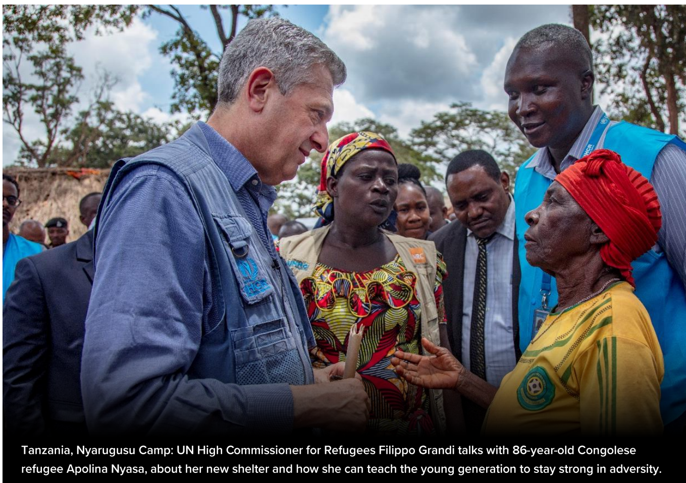
Tanzania, Nyarugusu Camp: UN High Commissioner for Refugees Filippo Grandi talks with 86-year-old Congolese refugee Apolina Nyasa, about her new shelter and how she can teach the young generation to stay strong in adversity.

decisions. These NGO consultations are also being progressively regionalized, and my hope is that this new approach will enable more focused and geographically relevant discussions.