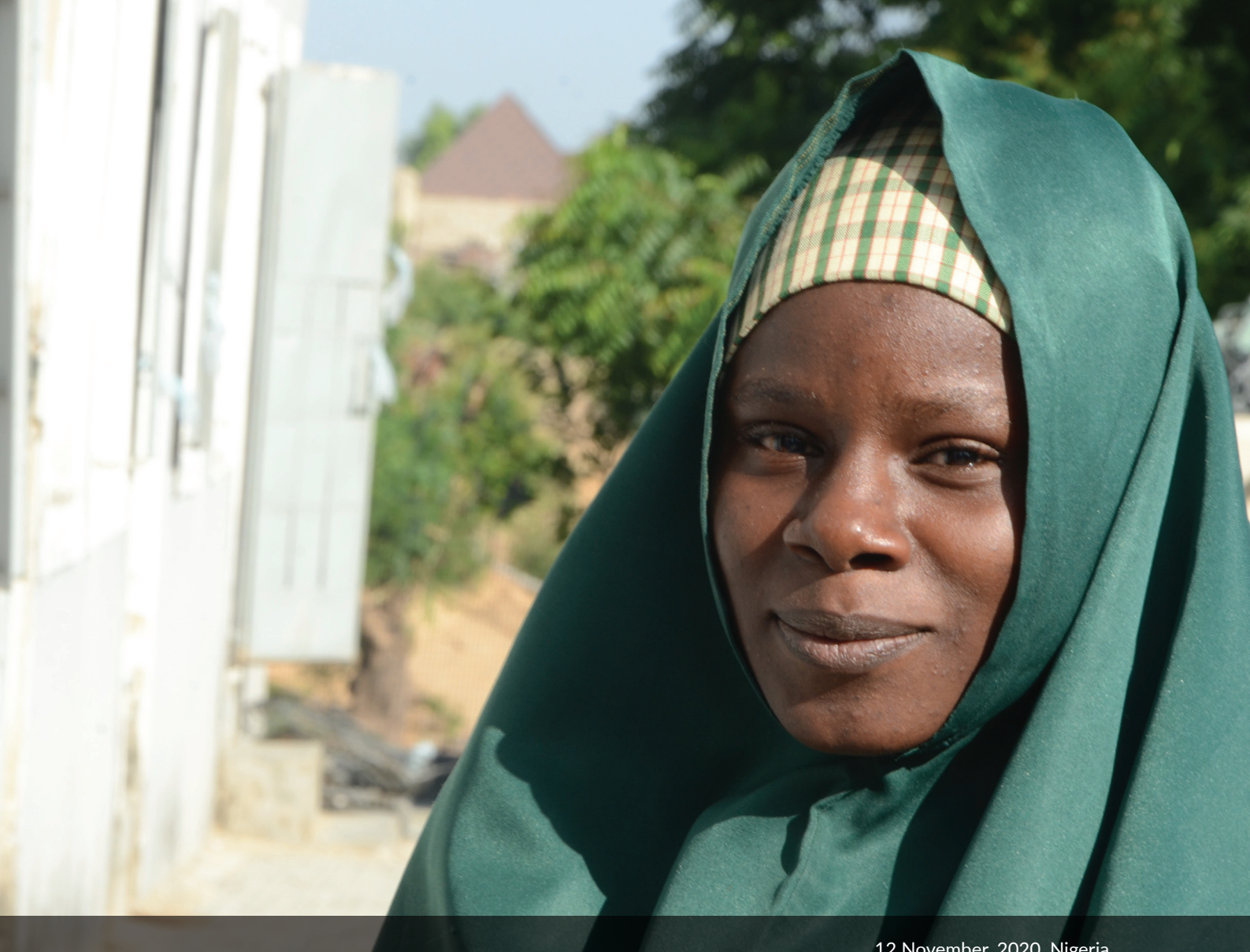
12 November, 2020, Nigeria. Internally displaced woman in Mohammed Goni International Stadium camp