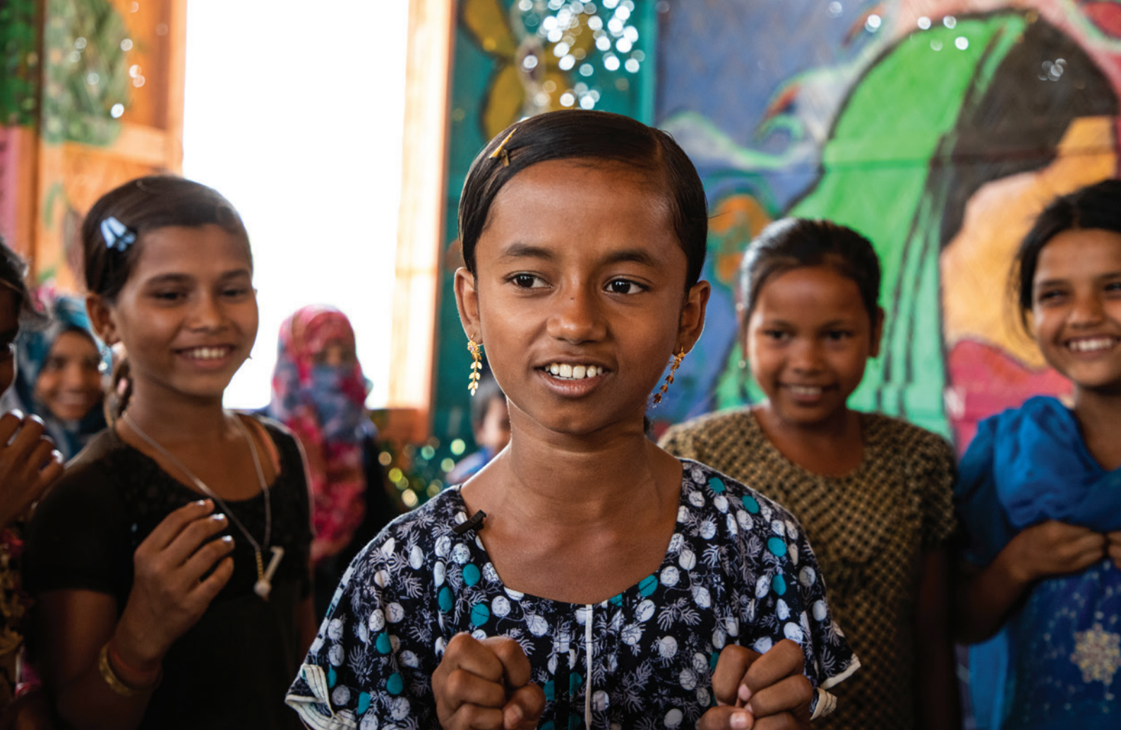
Bangladesh. Mental health project helps Rohingya youths discuss anxieties

Standard packages for MHPSS do not sufficiently address two problem areas that are explicitly mentioned in the Sustainable Development Goals with an indicator to which all national governments have to report.