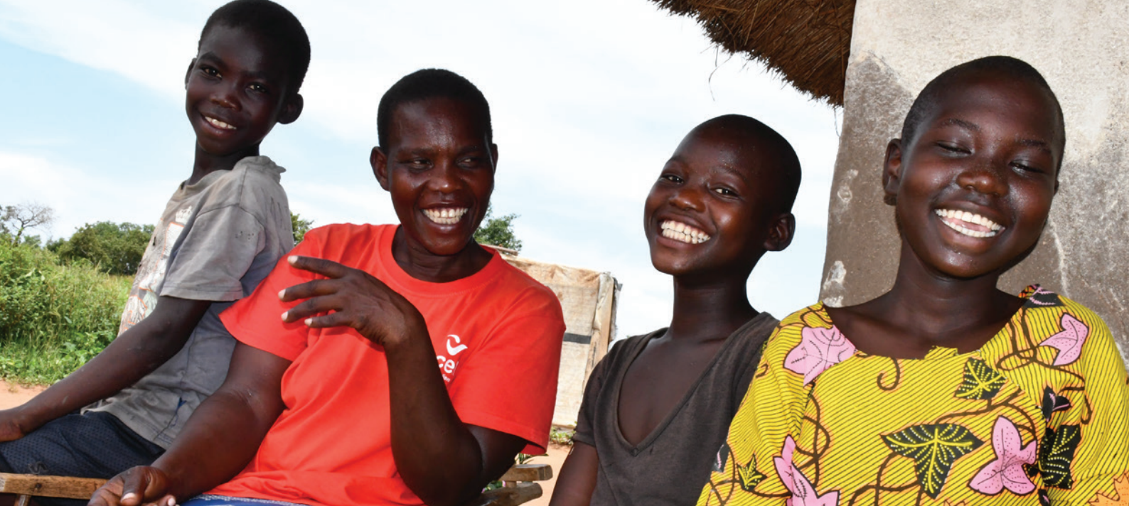
© UNHCR/Duniya Aslam Khan Uganda. Help is at hand for South Sudanese refugees living with HIV.

Services in the Context of COVID-19 and IAWG Programmatic Guidance for SRH in humanitarian and fragile settings during the COVID-19 pandemic