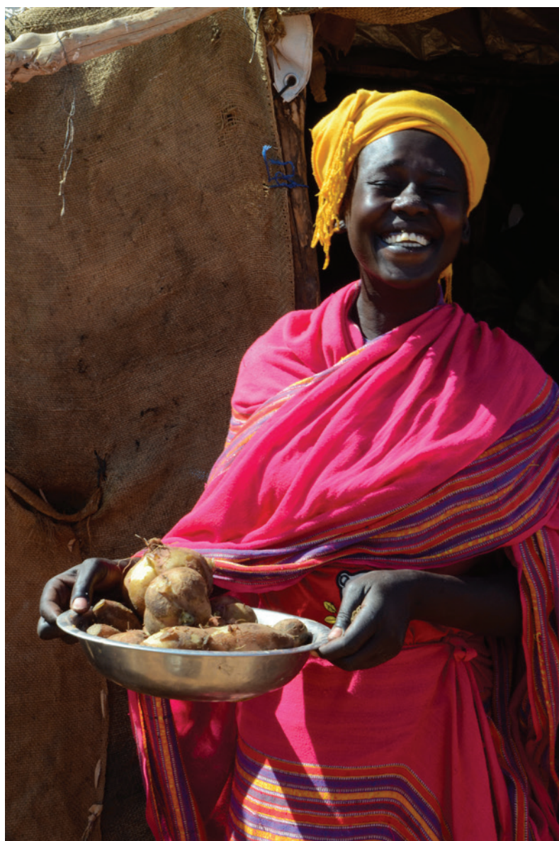
Sudan. Nivasha is one of several refugee settlements in the outskirts of the Sudanese capital Khartoum.

In 2019, of UNHCR's 77 refugee sites where acute malnutrition (wasting and nutritional oedema) was measured. 47 sites (61%) met the UNHCR standards of less than 10% Global Acute Malnutrition (GAM), while 10 sites (13.0%) showed GAM levels equal to or above the emergency threshold of 15%. Treatment options for acute malnutrition exist either through services provided in refugee camps