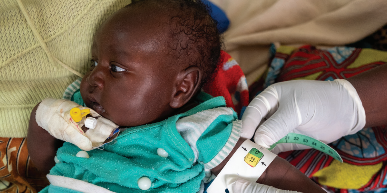
Kenya. Caring for refugee children on a Kakuma paediatric ward