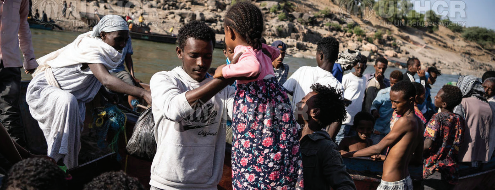
Sudan. Ethiopians flee to Sudan to take Shelter.