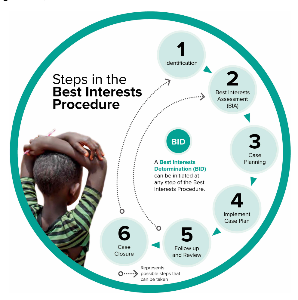
FIGURE: Steps in the Best Interests Procedure. BIP is a multi-step process to address the risks faced by individual children. BID is a component of BIP. For guidance, see section 3.2 of the 2021 BIP Guidelines<sup>12</sup>.