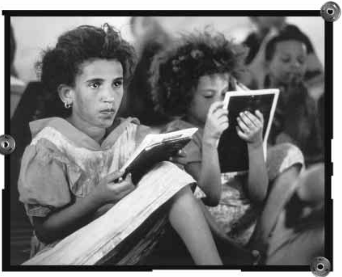
Refugee girls from Mali. M'Berra Camp School, Mauritania.

Together, these characteristics affect the child's readiness to learn, which interacts, in turn, with school quality. A child with a high degree of readiness is better able to take advantage of high-quality learning resources, or to compensate for their lack. A child with low readiness is less able to capitalize on learning opportunities, and more vulnerable to deficient learning environments. However obvious these factors are, schools often do little to adapt their programmes to fit the characteristics of the child, especially children on the margin.