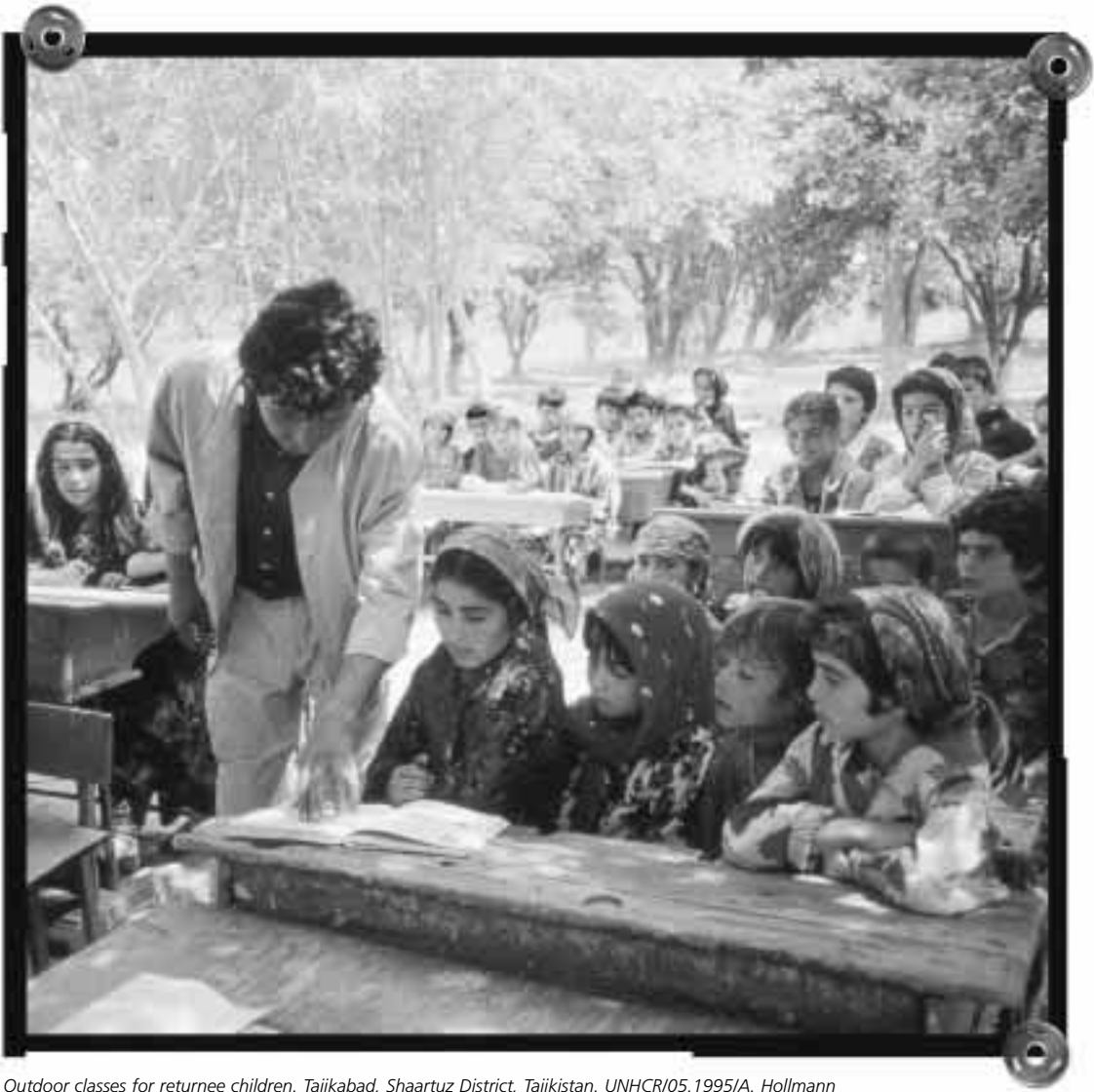
Outdoor classes for returnee children. Tajikabad, Shaartuz District, Tajikistan.

She cautions that quality improvements must be considered as a package because the factors are not independent of each other. Thus, for example, teacher training is unlikely to improve quality if appropriate textbooks and equipment are not available.