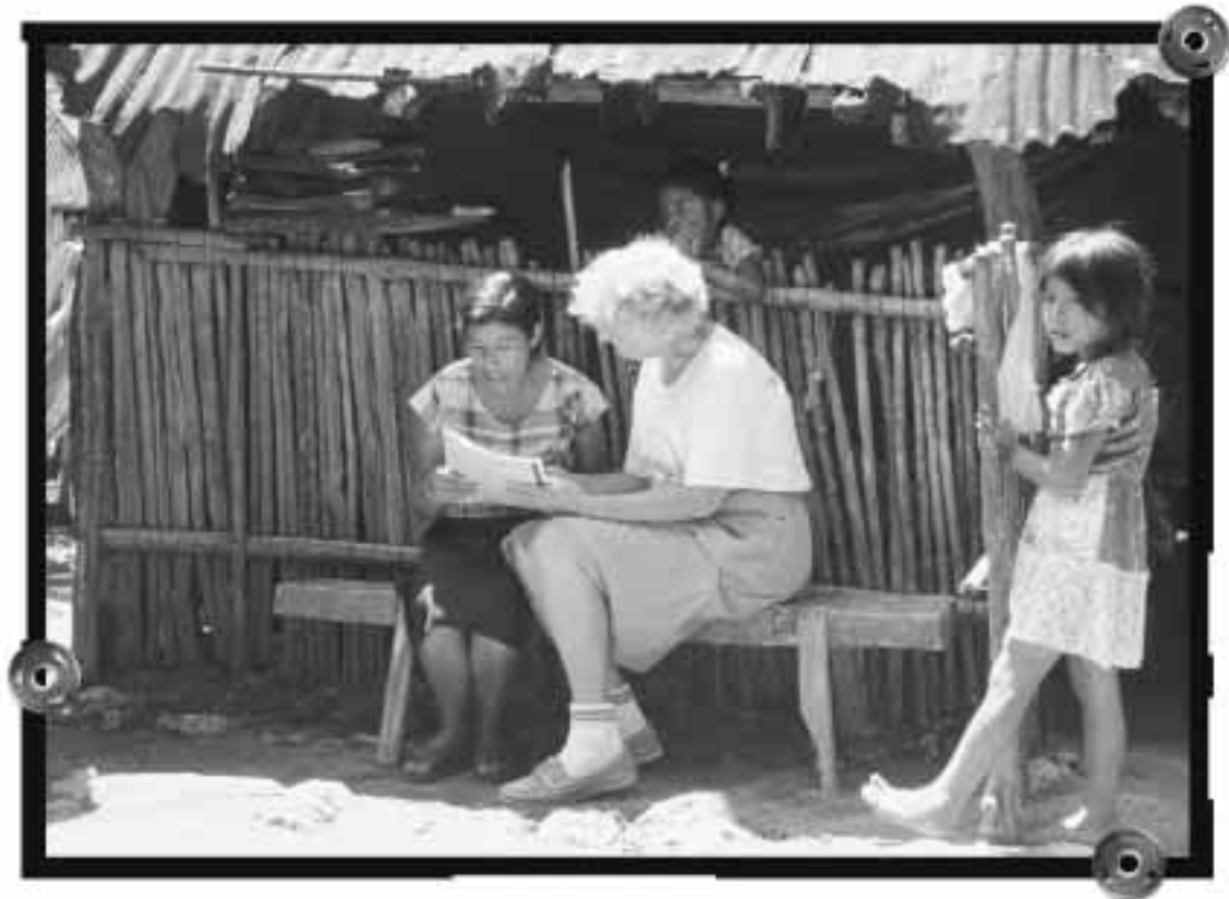
U.S. nun teaching Spanish to Guatemalan refugees. Keste Camp, Campeche, Mexico.