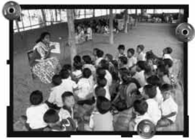
Refugee and returnee children and their teacher in a 'classroom'. Madhu, Sri Lanka.