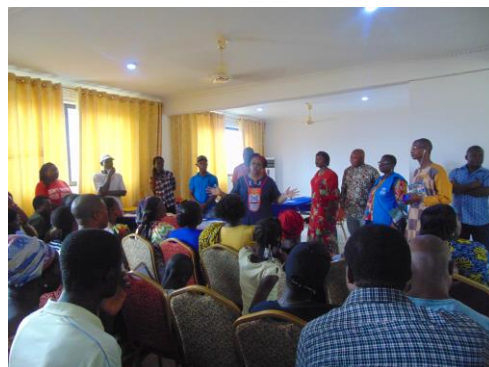
Liberia's Deputy Minister of Legal Affairs, Counsellor Deweh Grah addressing some locally integrating Liberians benefitting from a passport renewal exercise