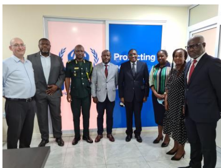
UNHCR Country Rep with officials from Ivory Coast, Ghana Immigration Service and Ghana Refugee Board.