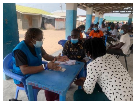
Registration of intentions exercise in Ampain Camp.