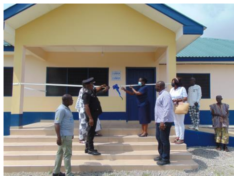
UNHCR Country Rep cutting the sod for the opening of a new police station at Krisan. With her are the Deputy Western regional Police Commander, the Chief and Ag. Exec sec of GRB.