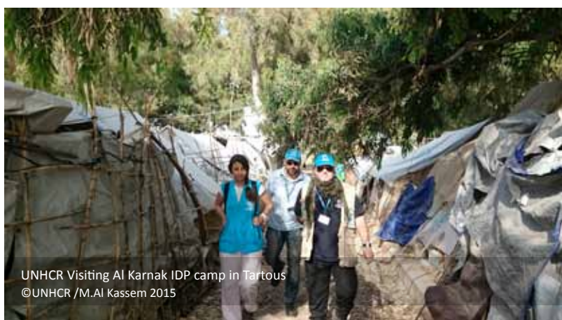
UNHCR Visiting Al Karnak IDP camp in Tartous