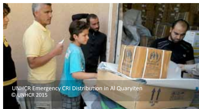
UNHCR Emergency CRI Distribution in Al Quaryiten

At the end of May, UNHCR reached another milestone when it distributed its five millionth CRI in 2015. As of start of June 5,229,392 CRIs had been dispatched to 1,184,230 beneficiaries, despite the many challenges such as insecurity faced on a daily basis by UNHCR staff.