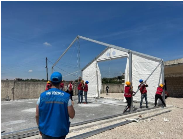
Installation of a Rubb hall in Latakia to be used as a temporary classroom for children.

installed in the school yards and will be used as temporary classrooms for children. The installation of the remaining Rubb halls is ongoing.