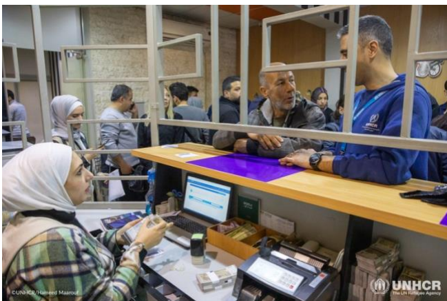
First distribution of emergency cash assistance to people affected by the earthquakes in Aleppo on 15 April.