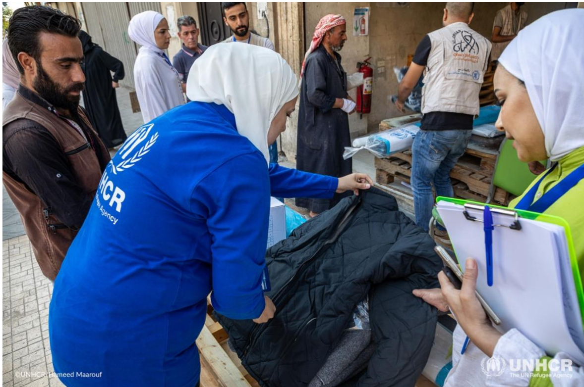
Winter items distributed to displaced persons in Aleppo Governorate.

UNHCR's winter assistance targets the most vulnerable people, including those recently displaced, newly returned, living in hard-to-reach or newly accessible areas, or in sub-standard shelters as well as people with specific needs.