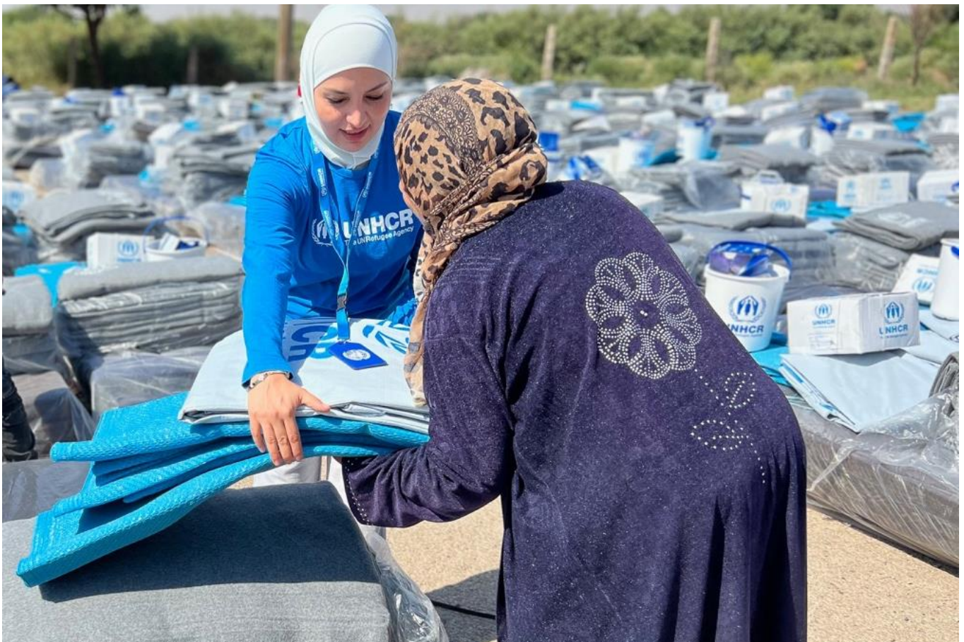
Distribution of CRIs to internally displaced people in Deir-ez-Zor Governorate.

of the population in Syria are in need of humanitarian assistance