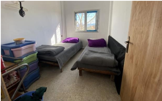
A house of an internally displaced family in rural Latakia Governorate after being repaired by UNHCR