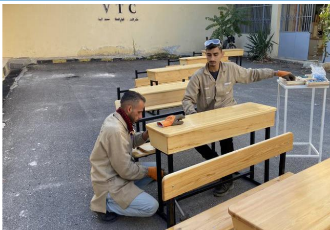
Trained displaced persons and returnees manufacturing desks for a rehabilitated school in Aleppo Governorate.