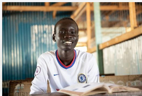
Aguer the best performing student ever in the Kenya Certificate of Primary School Exams poses for a photo at his school

A total of 9,594 students (3,503 girls) sat the Kenya Certificate of Primary Education (KCPE) examinations and almost half of students scored above average. The mean score from schools in both Kakuma and Kalobeyei improved from last year. A total of 3,318 students (1,013 girls) sat for the Kenya Certificate of Secondary Education (KCSE).