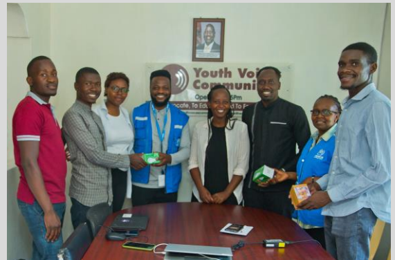
Solar bulbs are handed over to refugees in Nairobi.