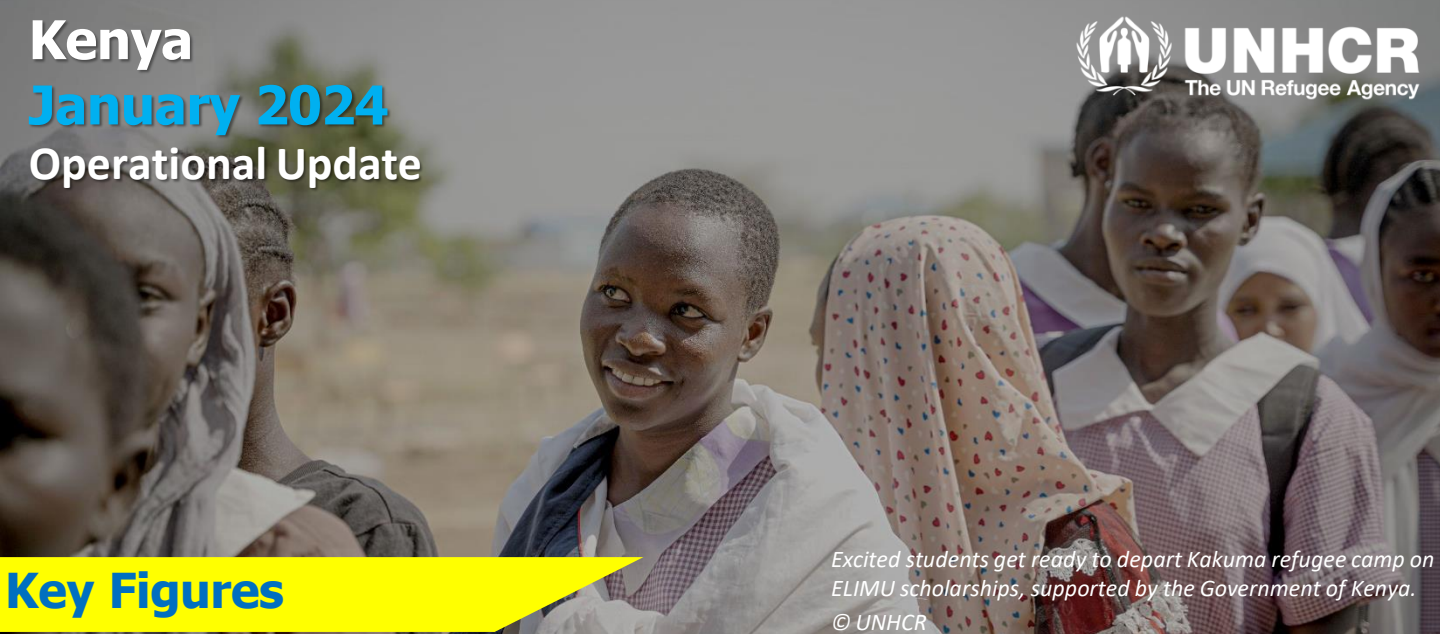
Excited students get ready to depart Kakuma refugee camp on ELIMU scholarships, supported by the Government of Kenya.