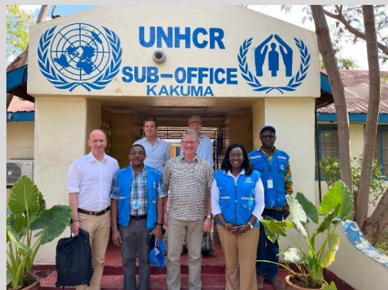
The Danish delegation from the Novo Nordisk Foundation and the Ambassador of Denmark to Kenya with the UNHCR Kenya Representative, Head of Kakuma Sub-Office and UNHCR Kenya's Senior Public Health Officer, at the UNHCR Sub-office in Kakuma.