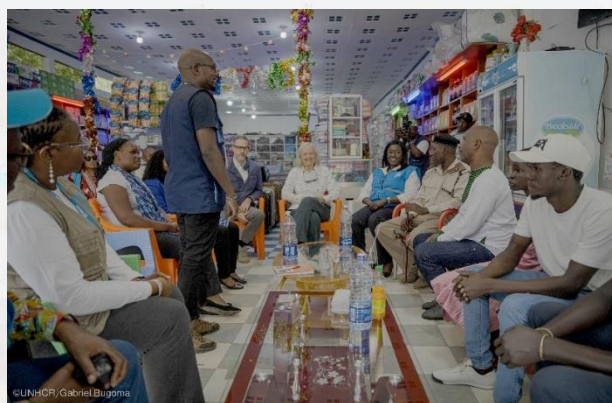
The U.S. Ambassador listens to refugee business leaders in Kakuma.

UNHCR Kenya welcomed the U.S. Ambassador to Kakuma and the Kalobeyei Integrated Settlement. The Ambassador visited the Renewvia Energy solar mini-grid providing green energy to 2,500 households, and then met with business owners.