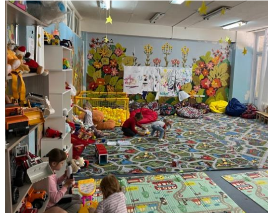
A daycare inside the TAP in Kaluga Oblast. 21 July 2022