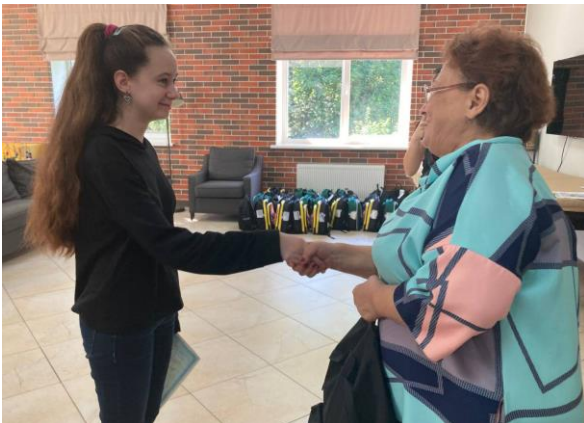
Distribution of school supplies to Ukrainian refugee children by the RRC, at a temporary accommodation point in Tula. 12 August 2022