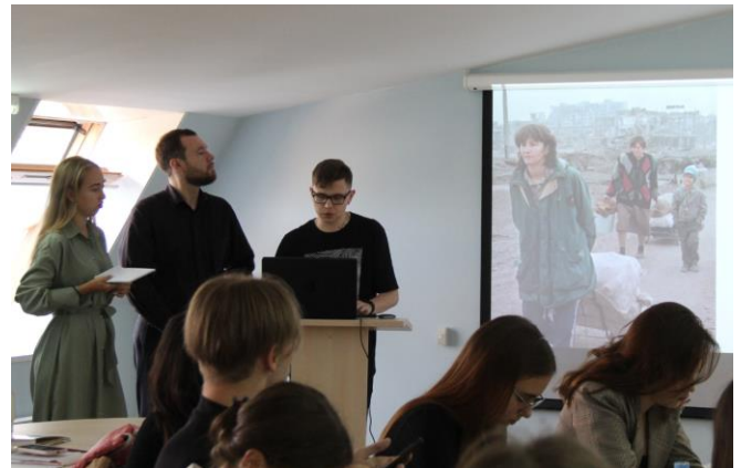
Students presenting during the VI Summer School on Migration in St. Petersburg. 23 August 2022