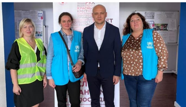
UNHCR and the Russian Red Cross during a visit to temporary accommodation points in the city of Volgograd. 23 September 2022