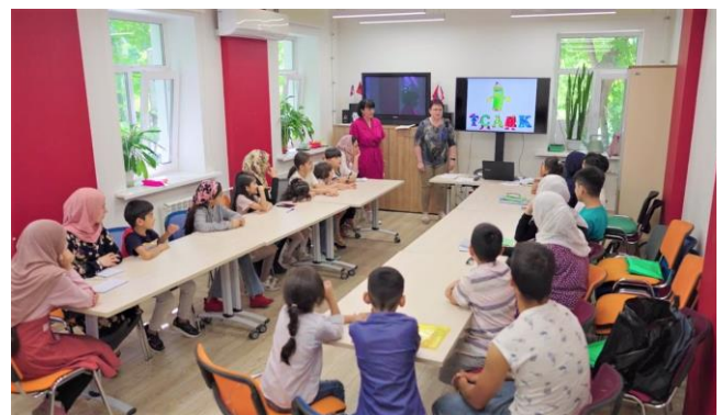
Refugee children attend a Russian language class funded by UNHCR and organized by a partner NGO. 1 September 2022