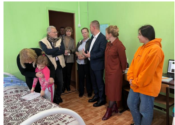
UNHCR Russia staff and representatives of the Office of the Commissioner for Human Rights in Russia during a visit to a TAP in Klin, Moscow region.