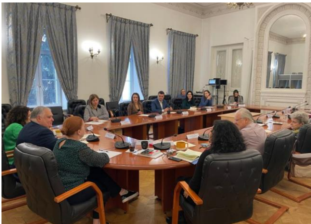
UNHCR Russia hosting monthly coordination with partners to discuss plans for 2023. Moscow