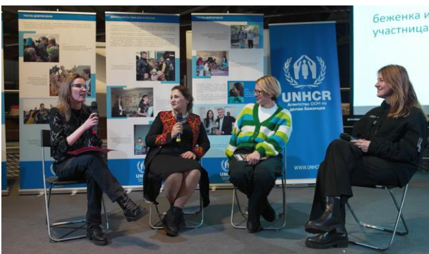
Presentation of "Kitchen Stories" cookbook at the Jewish Museum and Tolerance Center featuring one of the refugee heroes of the project, creators of the book and the editor-in-chief of the "Novyi Ochag" magazine.