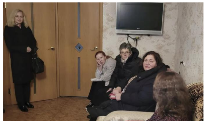
UNHCR Russia staff during a monitoring visit to a family of Ukrainian refugees in one of the TAP-apartments in Nizhny Novgorod.