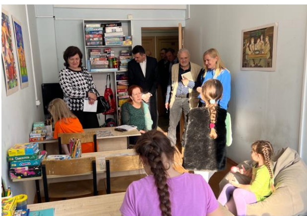
UNHCR Russia staff and representatives of the Office of the Commissioner for Human Rights in Russia during a visit to a TAP in Tikhvin, Leningrad region.