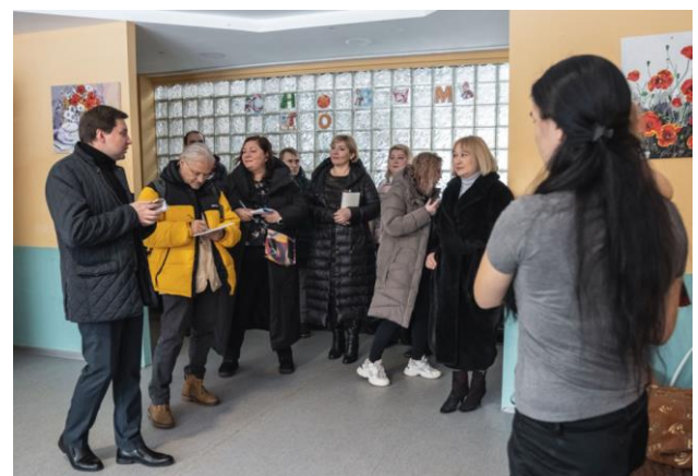
UNHCR Russia staff and representatives of the Office of the Commissioner for Human Rights in Russia during a visit to a TAP in Volokolamsk, Moscow region.