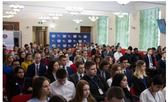
Students attending the opening ceremony of the UN Model at the Diplomatic Academy of the MFA.