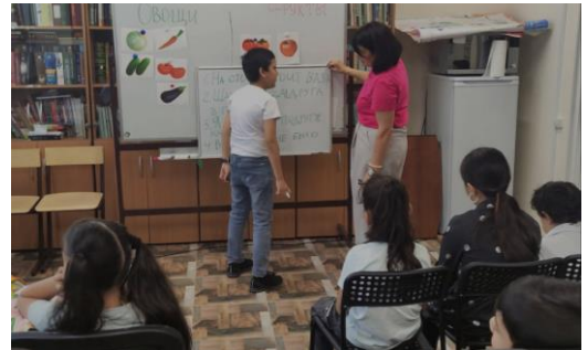
Final lesson of the school preparation course for refugee children in Moscow