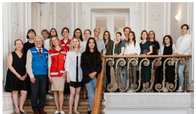
Volunteers from partner NGOs attending World Humanitarian Day event at the UN House in Moscow