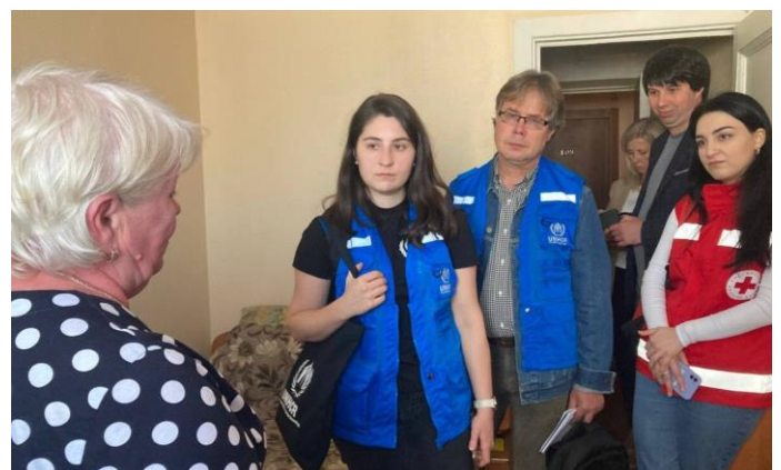
UNHCR and the Russian Red Cross visiting Ukrainian refugees hosted at a TAP in Ivanovo