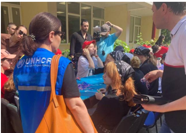
UNHCR and partners visit a Temporary Accommodation Point in Klin